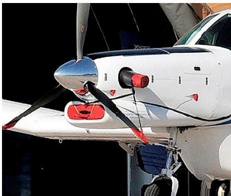
750XL Engine Inlet Plugs & Prop Tie/Exhaust Covers