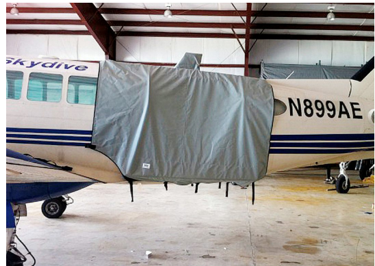
750XL Jump Door Cover