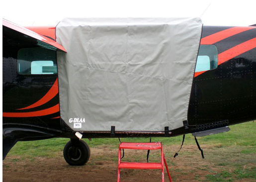
Cessna 208 Caravan Jump Door Cover