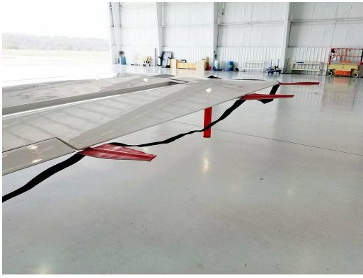
Hawker Beechcraft 800, 800XP, 850XP Static Wick Protectors