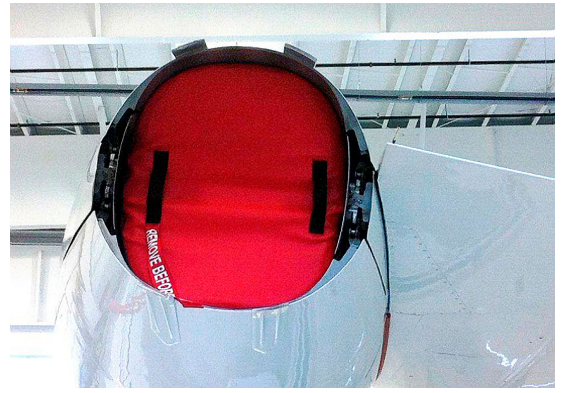
Falcon 2000EX Exhaust Plug