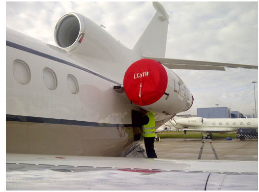
Falcon 900EX Engine Covers