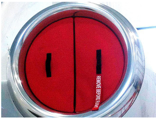
Falcon 2000EX Intake Plug