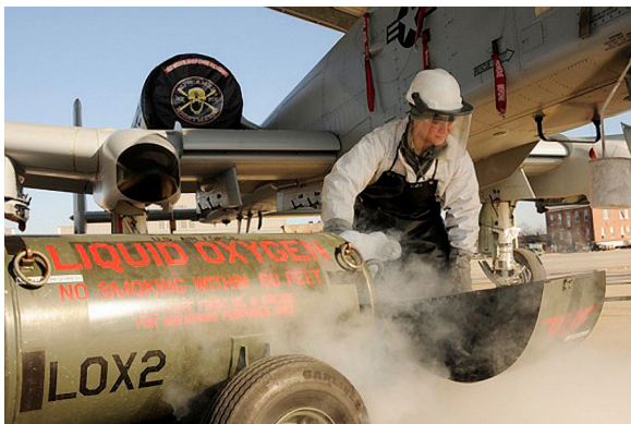
A-10 Engine Intake Cover

ALL-YEAR USE MATERIAL - Made with Solution dyed Polyester fabric, the all-year use material is the best option for sun protection and cover longevity. This heavier more durable material is intended for all weather conditions, such as rain and snow or lots of sun.