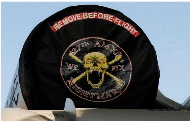
A-10 Engine Covers with Custom Artwork

ALL-YEAR USE MATERIAL - Made with Solution dyed Polyester fabric, the all-year use material is the best option for sun protection and cover longevity. This heavier more durable material is intended for all weather conditions, such as rain and snow or lots of sun.