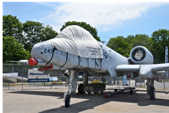
Fairchild A10 Thunderbolt Canopy Cover, Nose Gun Cover, Gun Scoop Inlet Plug