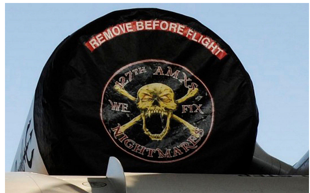
A-10 Engine Covers with Custom Artwork