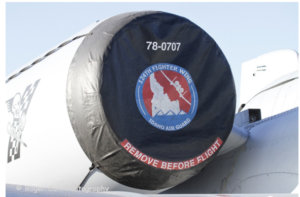
Fairchild A-10 Engine Covers