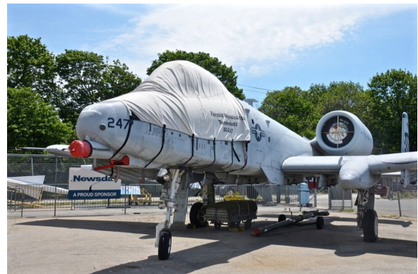
Fairchild A10 Thunderbolt Nose Gun Cover, Gun Scoop Inlet Plug