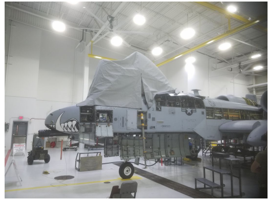
Fairchild A-10 Canopy Cover, open position