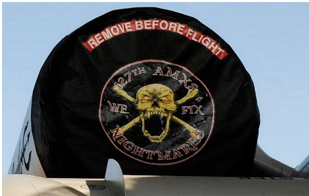
A-10 Engine Covers with Custom Artwork

ALL-YEAR USE MATERIAL - Made with Solution dyed Polyester fabric, the all-year use material is the best option for sun protection and cover longevity. This heavier more durable material is intended for all weather conditions, such as rain and snow or lots of sun.