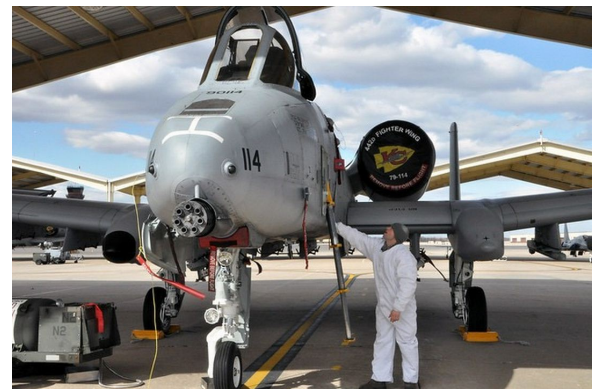
Fairchild A10 Intake Covers & Nose Gun Scoop Plug