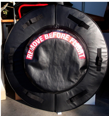
A-10 Exhaust Plug/Cover

The Engine Inlet Plugs are custom fit for your Fairchild A10 Thunderbolt intakes, made with heavy-duty vinyl material, and stuffed with a single block of sculpted urethane foam. Each plug has a zipper that allows the foam to be removed and dried if necessary. Engine plugs have 'remove before flight' streamers sewn onto the face of the plugs. Most plugs are imprinted with the aircraft registration number in black for an extra charge. Storage bag NOT included. Engine plugs may be inserted after flight when the engine is still warm. Engine Inlet Plugs are commonly referred to as Cowl Plugs, Intake Plugs, Cowl Blocks, Engine Blocks, and Engine Bungs.