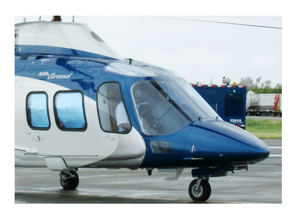
Agusta Grand Cabin & Skylight HeatShields