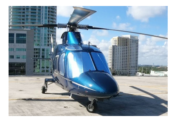
Agusta AW109 Power, A109E Heatshield Set

Cabin Heatshields are interior sunshades for the aircraft's passenger cabin area. The product is a unique composite of closed-cell foam with a silver mylar finish. The semi-rigid design is stiff enough to stand inside the window framing. The set folds up flat and is easily stored in the included storage sleeve. Some designs may require velcro and suction cups. A Heatshield is an excellent short-term remedy for cockpit overheating, but an external fabric cover is more effective for long-term protection.