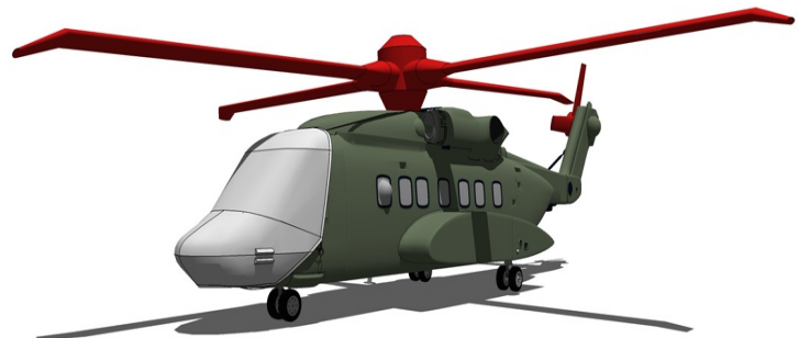
Sikorsky S-92 Windshield/Nose, Blade, Rotor Hub & Tail Rotor Covers