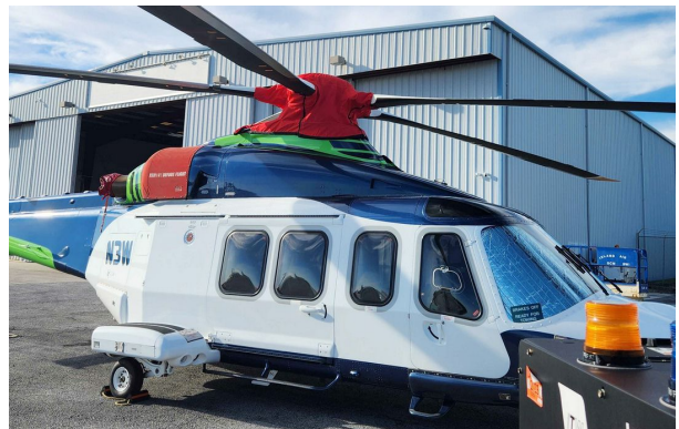
Agusta AW139 Rotor Mast Cover, covers upper deck & aft of rotor mast area