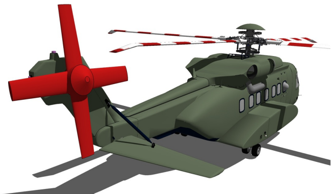
Sikorsky S-92 Tail Rotor Blade and Hub Covers

WINTER USE MATERIAL - Made with Solution-Dyed Polyester fabric, this option is intended for seasonal use to aid in deicing, rain mitigation, or for occasional travel. The material is lighter and more compact, but more susceptible to UV damage and may have a shorter useful life if used continuously outside than the all-year use material.