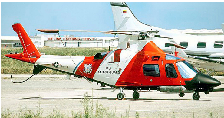
Covers, Plugs, HeatShields and related items for the Agusta MH-68A

Heatshields are interior sunshades for an aircraft's windows or canopy glass. The product is a unique composite of closed-cell foam with a silver mylar finish. The semi-rigid design is stiff enough to stand along the inside of the windshield using sun visors or window framing. It folds up flat and easily stores in the included storage sleeve. Some designs may require velcro and suction cups. A Heatshield is an excellent short-term remedy for cockpit overheating.