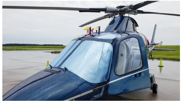
Agusta AW109S/SP Grand Heatshield Set