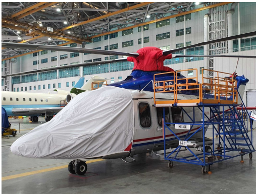
Agusta AW139 Cockpit/Nose, Rotor Mast Cover

This cover type is made from Silver Acrylic Sunbrella canvas and is 100% lined with a soft and smooth microfiber. Bruce's Custom Covers developed this material combination especially for aircraft protection. The outer material is medium weight and treated for water resistance, UV resistance and anti-static buildup. The inner lining is a very soft and smooth microfiber to prevent scratching. The material is very reflective, and tests show that the cabin interior temperature can be reduced to near-ambient temperature on the hottest of days. It is water, ice and snow repellent, yet breathable to allow moisture to escape from between the cover and the aircraft surface.