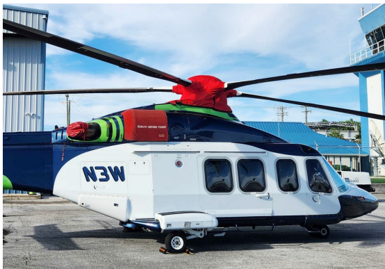
Agusta AW139 Rotor Mast Cover, covers upper deck & aft of rotor mast area

WINTER USE MATERIAL - Made with Solution-Dyed Polyester fabric, this option is intended for seasonal use to aid in deicing, rain mitigation, or for occasional travel. The material is lighter and more compact, but more susceptible to UV damage and may have a shorter useful life if used continuously outside than the all-year use material.