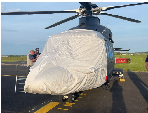
Agusta AW139 Cockpit/Nose Cover

This cover type is made from Silver Acrylic Sunbrella canvas and is 100% lined with a soft and smooth microfiber. Bruce's Custom Covers developed this material combination especially for aircraft protection. The outer material is medium weight and treated for water resistance, UV resistance and anti-static buildup. The inner lining is a very soft and smooth microfiber to prevent scratching. The material is very reflective, and tests show that the cabin interior temperature can be reduced to near-ambient temperature on the hottest of days. It is water, ice and snow repellent, yet breathable to allow moisture to escape from between the cover and the aircraft surface.