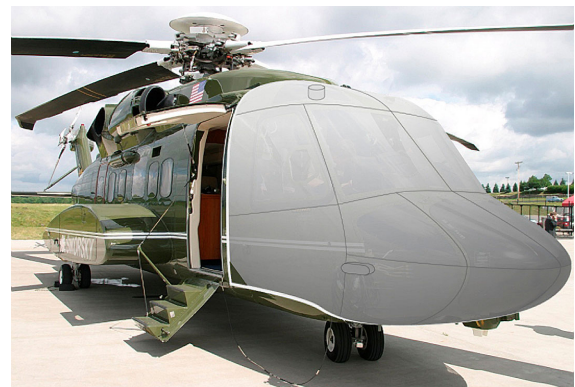
Sikorsky S-92 Windshield/Nose Cover (illustration)