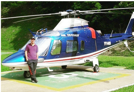
Agusta Power Cockpit & Cabin HeatShields

Cockpit Heatshields are interior sunshades for the aircraft's cockpit. The product is a unique composite of closed-cell foam with a silver mylar finish. The semi-rigid design is stiff enough to stand inside the window framing. Darts and folds are incorporated into the material so that it conforms to the complex shape of the helicopter windows. The set folds up flat and is easily stored in the included storage sleeve. Some designs may require velcro and suction cups. A Heatshield is an excellent short-term remedy for cockpit overheating, but an external fabric cover is more effective for long-term protection.