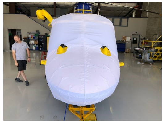
Leonardo (Agusta) A-169 Bubble Cover, test fit cover