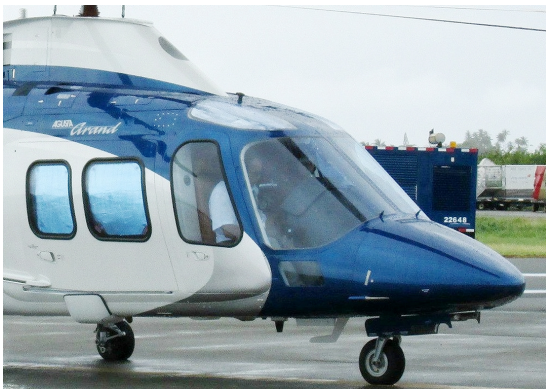
Agusta Grand Cabin & Skylight HeatShields

Cockpit Heatshields are interior sunshades for the aircraft's cockpit. The product is a unique composite of closed-cell foam with a silver mylar finish. The semi-rigid design is stiff enough to stand inside the window framing. Darts and folds are incorporated into the material so that it conforms to the complex shape of the helicopter windows. The set folds up flat and is easily stored in the included storage sleeve. Some designs may require velcro and suction cups. A Heatshield is an excellent short-term remedy for cockpit overheating, but an external fabric cover is more effective for long-term protection.