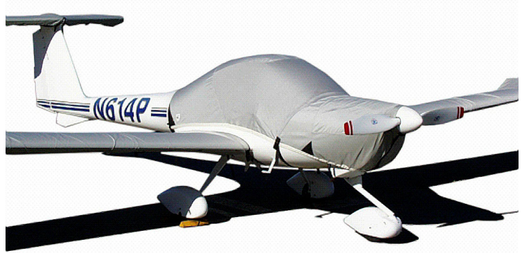
Diamond DA-20 Canopy/Engine, Wing & Horiz. Stab. Covers