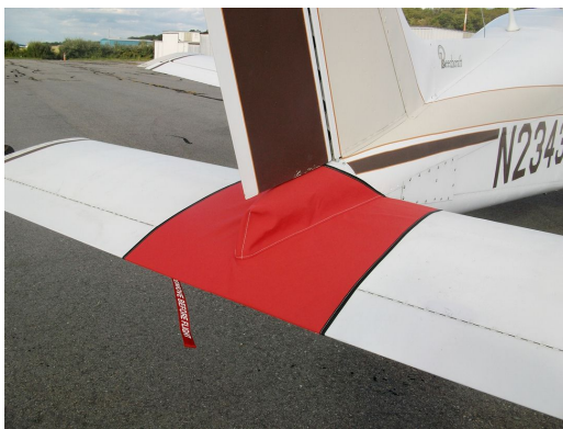
Beech Musketeer Tailcone Cover (Fully Enclosed)

WINTER USE MATERIAL - Made with Solution-Dyed Polyester fabric, this option is intended for seasonal use to aid in deicing, rain mitigation, or for occasional travel. The material is lighter and more compact, but more susceptible to UV damage and may have a shorter useful life if used continuously outside than the all-year use material.