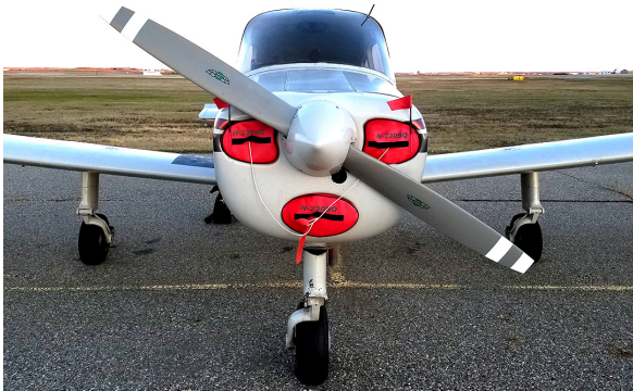
Beech Musketeer Engine Inlet Plugs

Engine Inlet Plugs are custom fit for your Beech Musketeer A23 intakes, made with heavy-duty vinyl material, and stuffed with a single block of sculpted urethane foam. Each plug has a zipper that allows the foam to be removed and dried if necessary. Engine plugs have warning flags that are visible from the cockpit or 'remove before flight' streamers sewn onto the face of the plugs. Most plugs are imprinted with the aircraft registration number in black for an extra charge. Storage bag NOT included. Engine plugs may be inserted after flight when the engine is still warm. Engine Inlet Plugs are commonly referred to as Cowl Plugs, Intake Plugs, Cowl Blocks, Engine Blocks, and Engine Bungs.