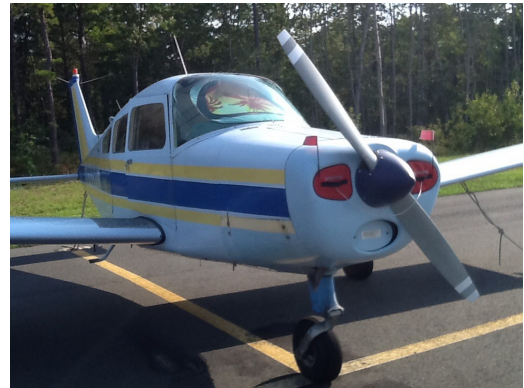
Beech Musketeer Engine Inlet Plugs