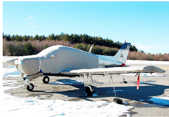
Prop, Engine, Extended Canopy, Wing, Tailcone, and Horizontal Stab Covers