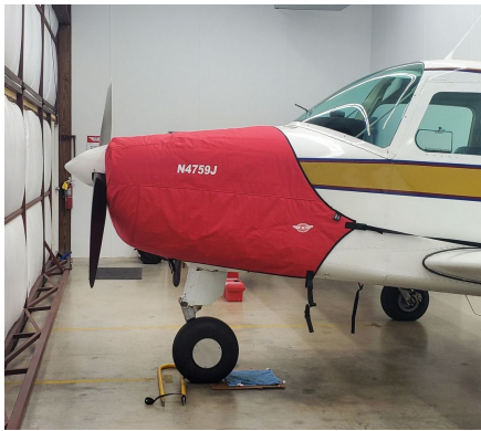
Beech A23-24 Super Musketeer Insulated Engine Cover

This cover type is made from Silver Acrylic Sunbrella canvas and is 100% lined with a soft and smooth microfiber. Bruce's Custom Covers developed this material combination especially for aircraft protection. The outer material is medium weight and treated for water resistance, UV resistance and anti-static buildup. The inner lining is a very soft and smooth microfiber to prevent scratching. The material is very reflective, and tests show that the cabin interior temperature can be reduced to near-ambient temperature on the hottest of days. It is water, ice and snow repellent, yet breathable to allow moisture to escape from between the cover and the aircraft surface.