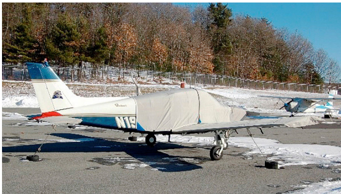
Beech Sierra Prop, Engine, Extended Canopy, Wing, Tailcone, and Horizontal Stab Covers.

This cover type is made from Silver Acrylic Sunbrella canvas and is 100% lined with a soft and smooth microfiber. Bruce's Custom Covers developed this material combination especially for aircraft protection. The outer material is medium weight and treated for water resistance, UV resistance and anti-static buildup. The inner lining is a very soft and smooth microfiber to prevent scratching. The material is very reflective, and tests show that the cabin interior temperature can be reduced to near-ambient temperature on the hottest of days. It is water, ice and snow repellent, yet breathable to allow moisture to escape from between the cover and the aircraft surface.