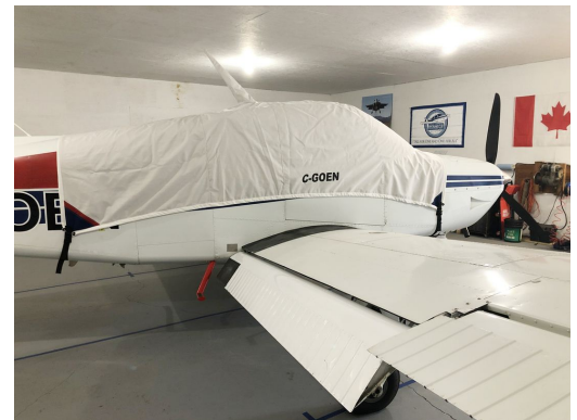
Beech Sierra B24R Canopy Cover