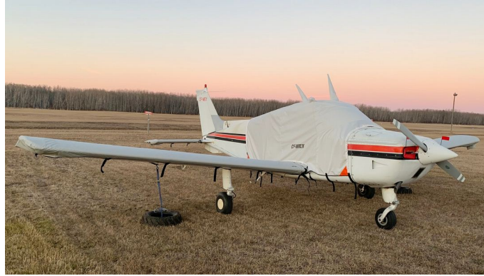
Sport B19 Engine Inlet Plugs