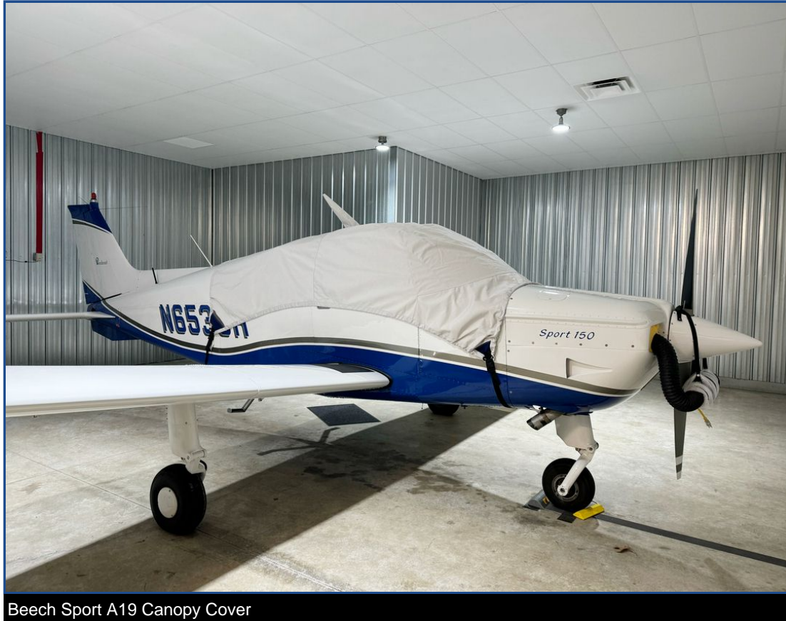
Beech Sport A19 Canopy Cover