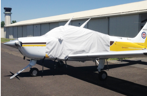
Beech Sundowner Extended Canopy Cover

This cover type is made from Silver Acrylic Sunbrella canvas and is 100% lined with a soft and smooth microfiber. Bruce's Custom Covers developed this material combination especially for aircraft protection. The outer material is medium weight and treated for water resistance, UV resistance and anti-static buildup. The inner lining is a very soft and smooth microfiber to prevent scratching. The material is very reflective, and tests show that the cabin interior temperature can be reduced to near-ambient temperature on the hottest of days. It is water, ice and snow repellent, yet breathable to allow moisture to escape from between the cover and the aircraft surface.