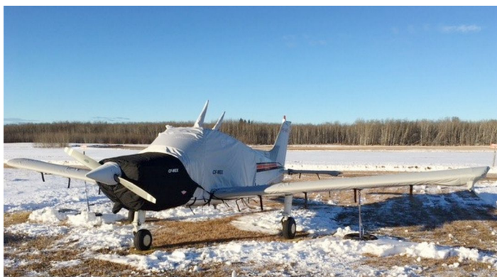
Beech Sport Insulated Engine Cover & Winter Cover Set

This cover type is made from Silver Acrylic Sunbrella canvas and is 100% lined with a soft and smooth microfiber. Bruce's Custom Covers developed this material combination especially for aircraft protection. The outer material is medium weight and treated for water resistance, UV resistance and anti-static buildup. The inner lining is a very soft and smooth microfiber to prevent scratching. The material is very reflective, and tests show that the cabin interior temperature can be reduced to near-ambient temperature on the hottest of days. It is water, ice and snow repellent, yet breathable to allow moisture to escape from between the cover and the aircraft surface.