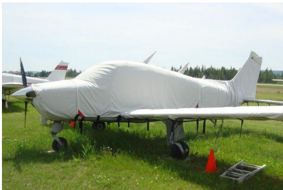
Beech Sierra Engine, Extended Canopy, Empennage, & Wing Covers

WINTER USE MATERIAL - Made with Solution-Dyed Polyester fabric, this option is intended for seasonal use to aid in deicing, rain mitigation, or for occasional travel. The material is lighter and more compact, but more susceptible to UV damage and may have a shorter useful life if used continuously outside than the all-year use material.