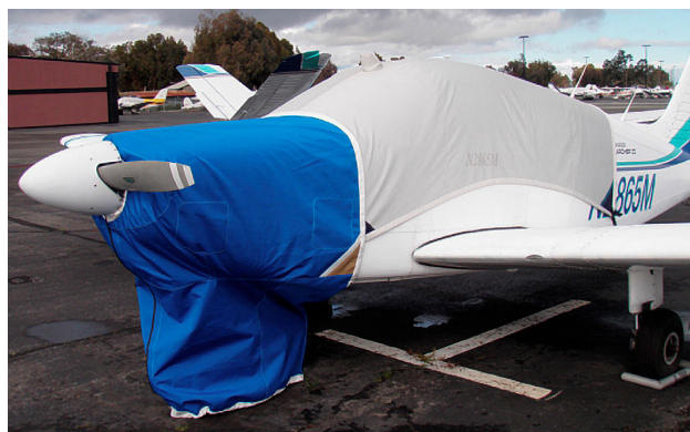
Beech Sierra Engine Cover (Covers Belly & Nose Gear Strut)