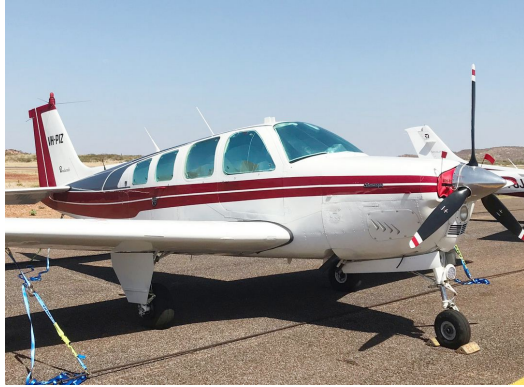
Beech A-36 Bonanza Cabin HeatShields

Windshield Heatshields are interior sunshades for an aircraft's front windshield. The product is a unique composite of closed-cell foam with a silver mylar finish. The semi-rigid design is stiff enough to stand along the inside of the windshield using sun visors or window framing. It folds up flat and easily stores in the included storage sleeve. Some designs may require velcro and suction cups or split right and left sides. A Heatshield is an excellent short-term remedy for cockpit overheating. An external fabric cover is far more effective and practical for long-term protection.