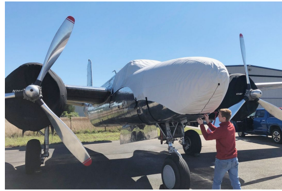
Douglas A26 Invader Cockpit/Nose Cover