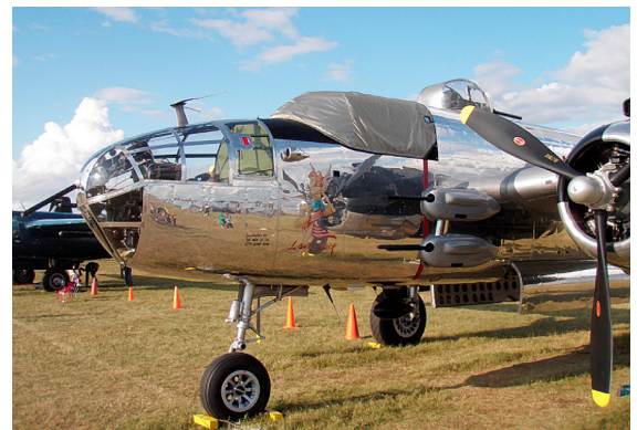
Mitchell B25 Cockpit Cover (Snap-On Type)