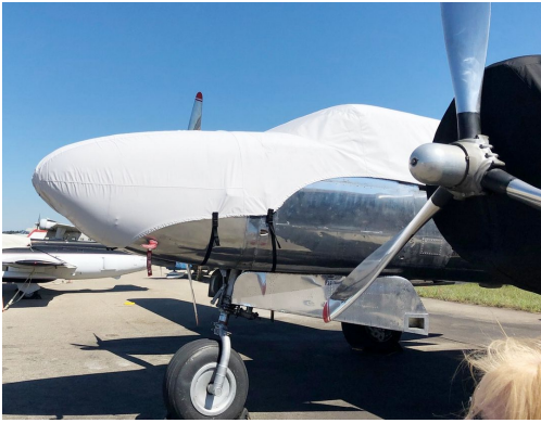
Douglas A26 Invader Cockpit/Nose Cover

the hottest of days. It is water, ice and snow repellent, yet breathable to allow moisture to escape from between the cover and the aircraft surface.