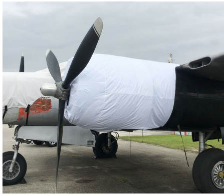
Douglas A-26 Engine Cover, test fit cover