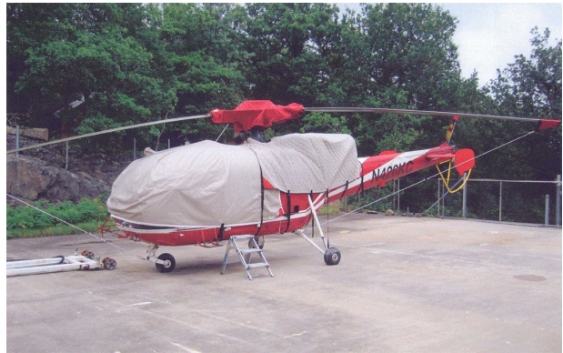
Alouette III Bubble, Rotor Hub & Engine Covers, Blade Tie-Downs