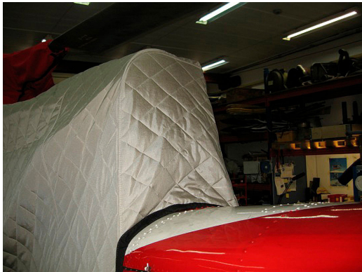
Alouette III Insulated Engine/Transmission Cover

shorter useful life if used continuously outside than the all-year use material.