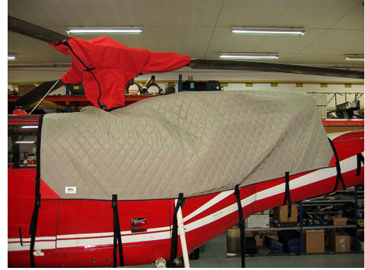
Alouette III Bubble, Rotor Hub & Engine Covers, Blade Tie-Downs