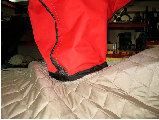
Alouette III Rotor Hub Cover & Engine/Transmission Cover

WINTER USE MATERIAL - Made with Solution-Dyed Polyester fabric, this option is intended for seasonal use to aid in deicing, rain mitigation, or for occasional travel. The material is lighter and more compact, but more susceptible to UV damage and may have a shorter useful life if used continuously outside than the all-year use material.