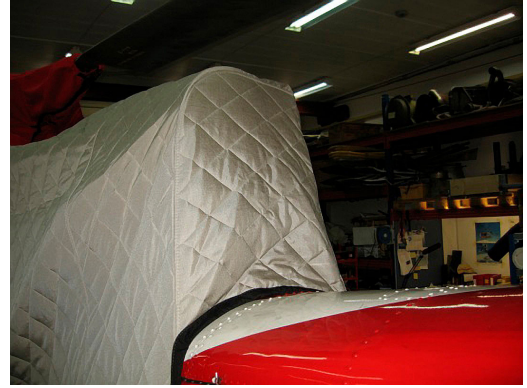
Alouette III Insulated Engine/Transmission Cover