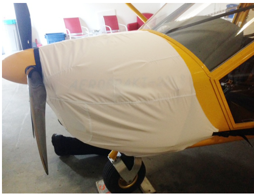
A-22 Engine Cover, test fit