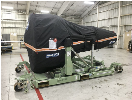
CFM56-5B Off Link Cover, fully enclosed

ALL-YEAR USE MATERIAL - Made with Solution dyed Polyester fabric, the all-year use material is the best option for sun protection and cover longevity. This heavier more durable material is intended for all weather conditions, such as rain and snow or lots of sun.