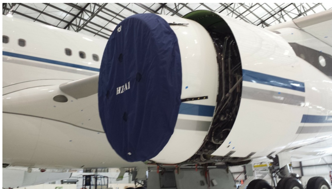
Airbus 340 Intake Covers