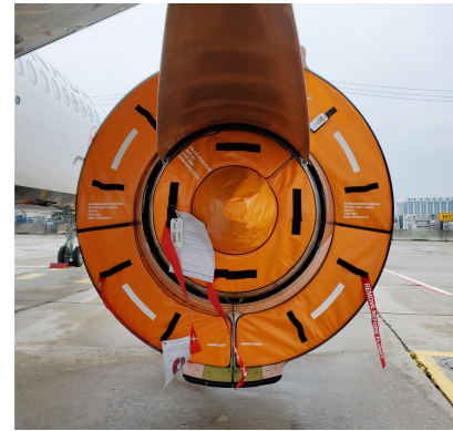
Airbus A320 Exhaust & Bypass Vent Plugs