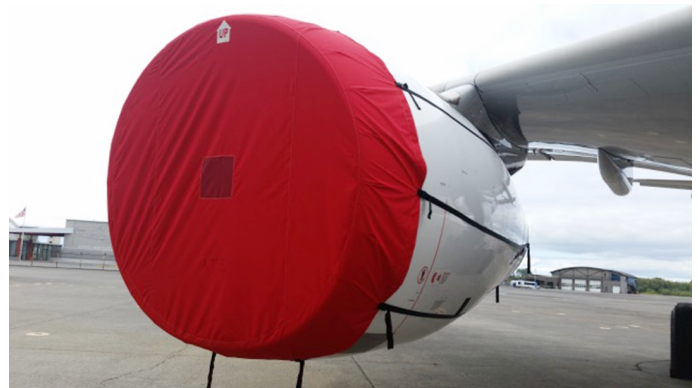
Airbus A330 Intake Cover, Trent 700 Engine