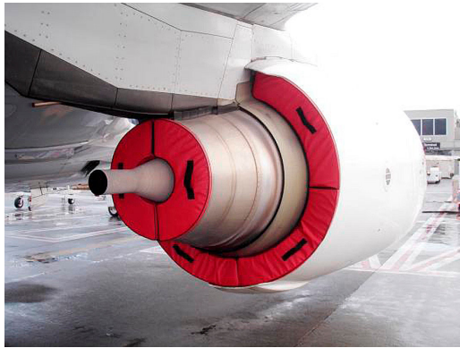
Boeing 737 Bypass and Exhaust Plugs

The Engine Exhaust Plugs are custom fit for your Airbus A330, A350 exhaust openings, made with heavy-duty vinyl material, and stuffed with a single block of sculpted urethane foam. Each plug has a zipper that allows the foam to be removed and dried if necessary. Exhaust plugs have 'remove before flight' streamers sewn onto the face of the plugs. Most plugs are imprinted with the aircraft registration number in black for an extra charge. Exhaust plugs may be inserted soon after flight when the engine is still warm. Engine Inlet Plugs are commonly referred to as Cowl Plugs, Intake Plugs, Cowl Blocks, Engine Blocks, and Engine Bungs.