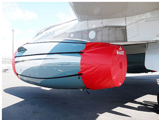
Airbus A319 Intake/Exhaust Covers set, IAE V2500