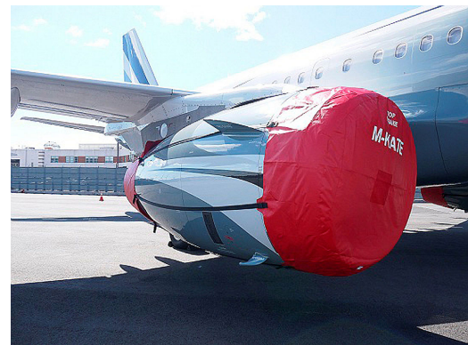
Airbus A319 Intake/Exhaust Covers set, IAE V2500