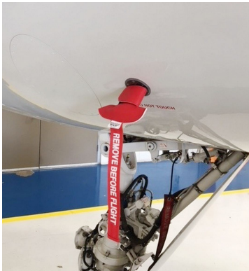
Grumman Gulfstream G-V Rosemont/TAT Cover

The Engine Inlet Plugs are custom fit for your Airbus A340 intakes, made with heavy-duty vinyl material, and stuffed with a single block of sculpted urethane foam. Each plug has a zipper that allows the foam to be removed and dried if necessary. Engine plugs have 'remove before flight' streamers sewn onto the face of the plugs. Most plugs are imprinted with the aircraft registration number in black for an extra charge. Storage bag NOT included. Engine plugs may be inserted after flight when the engine is still warm. Engine Inlet Plugs are commonly referred to as Cowl Plugs, Intake Plugs, Cowl Blocks, Engine Blocks, and Engine Bungs.