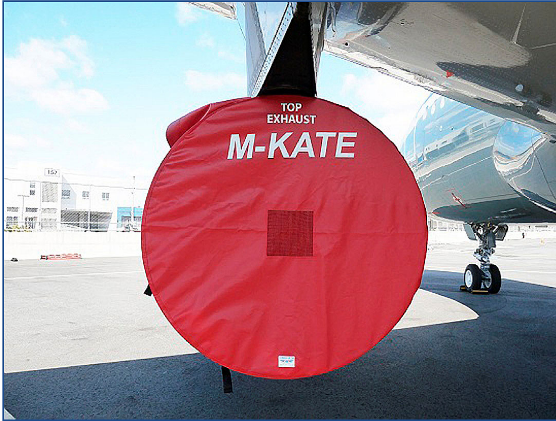
Airbus A319 Intake/Exhaust Covers set, IAE V2500