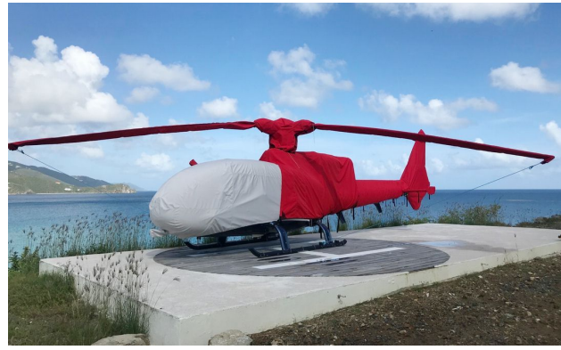
Aerospatiale AS341/342 Gazelle Full Cover Set