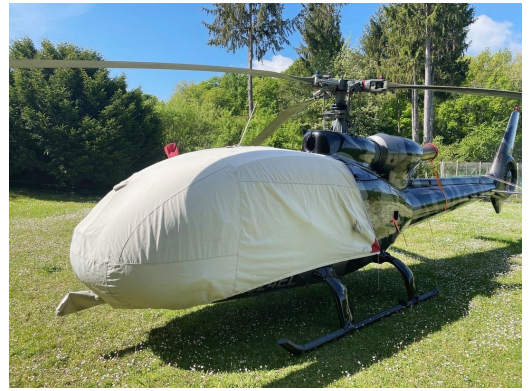
Aerospatiale Gazelle Bubble Cover