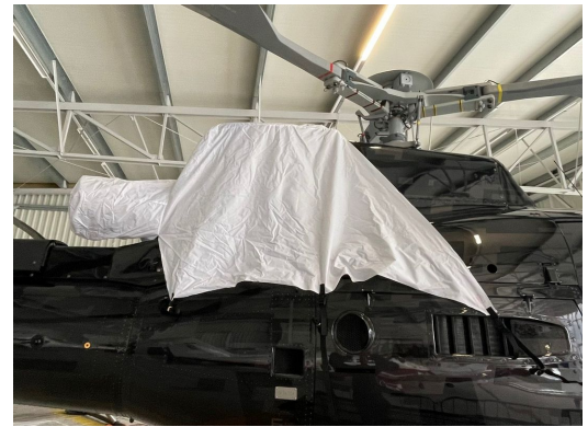
AS350 Intake/Exhaust Cover, test fit cover