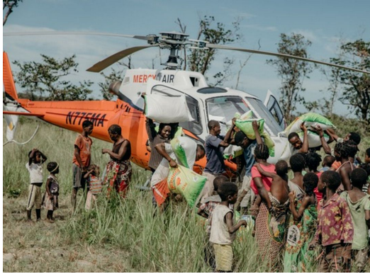
AS350 Windshield Heatshields

Heatshields are interior sunshades for an aircraft's windows or canopy glass. The product is a unique composite of closed-cell foam with a silver mylar finish. The semi-rigid design is stiff enough to stand along the inside of the windshield using sun visors or window framing. It folds up flat and easily stores in the included storage sleeve. Some designs may require velcro and suction cups. A Heatshield is an excellent short-term remedy for cockpit overheating.