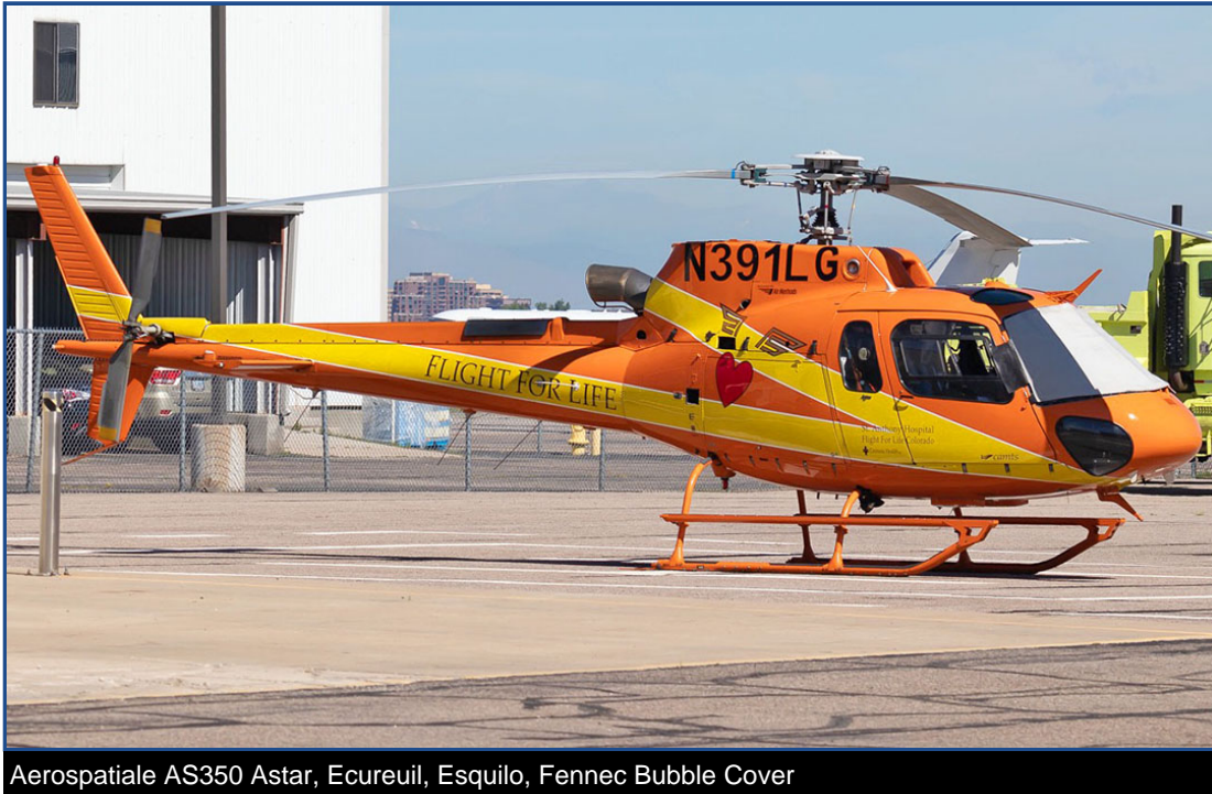
Aerospatiale AS350 Astar, Ecureuil, Esquilo, Fennec Bubble Cover