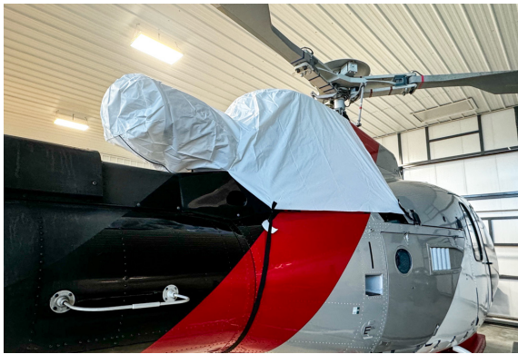
Airbus Helicopter AS350-B3 Intake/Exhaust Cover, test fit cover

WINTER USE MATERIAL - Made with Solution-Dyed Polyester fabric, this option is intended for seasonal use to aid in deicing, rain mitigation, or for occasional travel. The material is lighter and more compact, but more susceptible to UV damage and may have a shorter useful life if used continuously outside than the all-year use material.