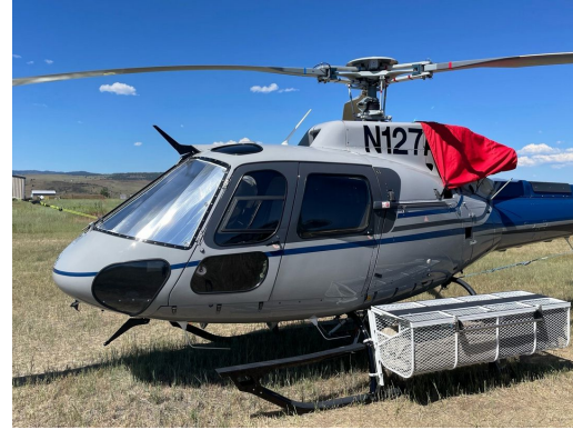
Eurocopter AS350-B3 Cabin HeatShields, Intake/Exhaust Cover