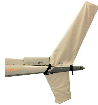
AS350B3 Vertical Stabilizers cover