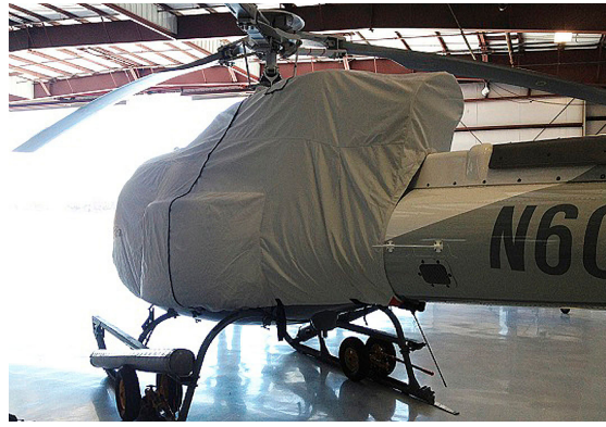
Eurocopter AS350 Main Body Cover AS350 B3 Main Body Cover (Covers Bubble/Cabin, Engine Area and Exhaust). Squirrel Cheeks.