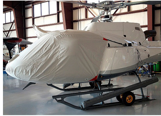
AS350 B3 Bubble Cover