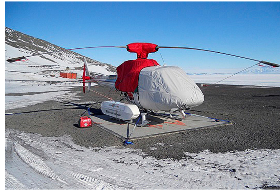
AS350 Bubble Cover w/ Cargo Mirror, Blade Tie-downs, Insulated Engine, Insulated Main Rotor Hub & Insulated Tail Rotor Covers