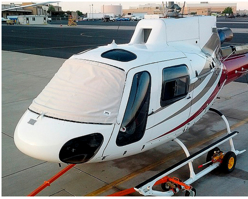
AS350 Windshield Cover, pinches in door jamba