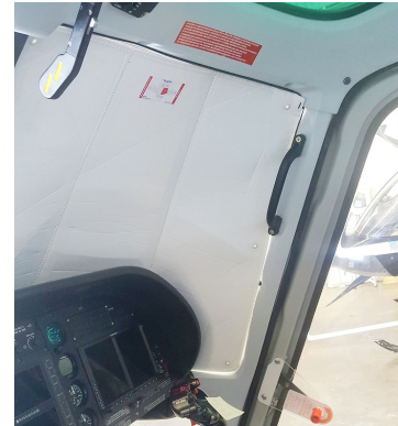
Aerospatiale AS350 Astar, Ecureuil, Esquilo, Fenec Windshield Heatshields