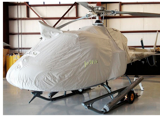
Eurocopter AS350 Main Body Cover