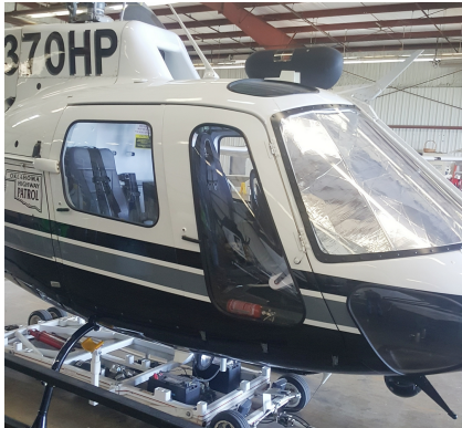
Aerospatiale AS350 Astar, Ecureuil, Esquilo, Fenec Windshield Heatshields

Heatshields are interior sunshades for an aircraft's windows or canopy glass. The product is a unique composite of closed-cell foam with a silver mylar finish. The semi-rigid design is stiff enough to stand along the inside of the windshield using sun visors or window framing. It folds up flat and easily stores in the included storage sleeve. Some designs may require velcro and suction cups. A Heatshield is an excellent short-term remedy for cockpit overheating.