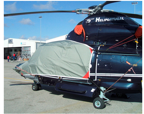
Dauphin Bubble Cover, extended nose