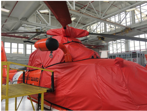
U.S. Coast Guard HH-65 Dolphin Bubble, Engine & Rotor Mast Covers

Travel Covers are made with Silver Solution-Dyed Polyester fabric and fully lined over the entire cover. The material is lightweight and more compact for easy storage in the aircraft. The polyester material is water resistant, but only intended for occasional use outside. We also have an ultra lightweight material available for fitted hangar dust covers. For daily outdoor use, the non-travel Sunbrella Cover is the best choice.