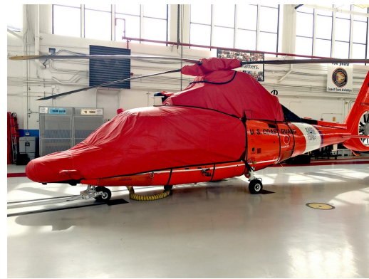
MH-65C Rotor Hub Cover w/ OADS Tube Cover detail