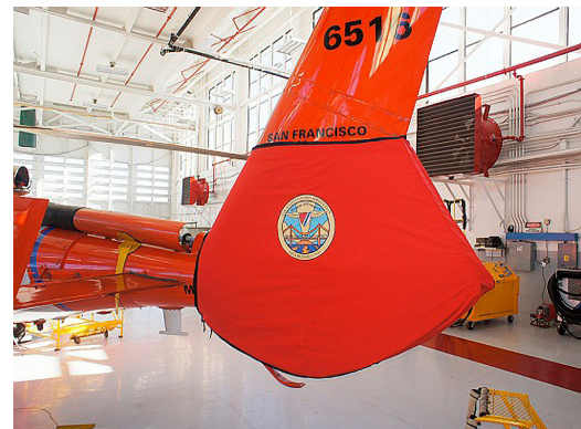
MH-365C Dauphin Tail Fan Fenestron Cover