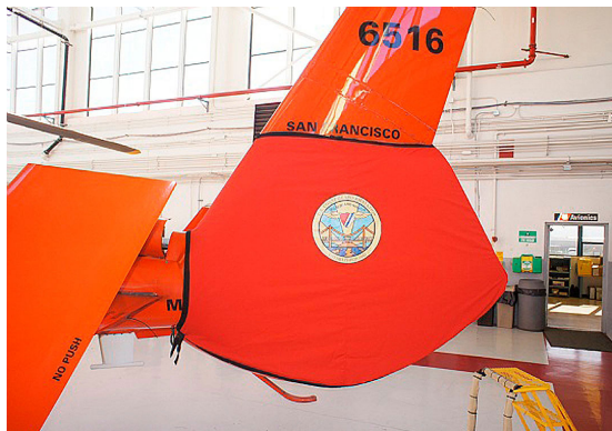
MH-365C Dauphin Tail Fan Fenestron Cover

The Tailboom Cover details vary by model, but generally the helicopter tail boom cover encloses the tail boom from the "bottleneck" to the aft end. They usually also cover the horizontal stabilizers, and are custom made to allow for antennae, lights, and other protrusions. They attach with straps underneath the tail boom. Covers for the vertical and horizontal stabilizers are also available separately. Specific information for each model is available on request.