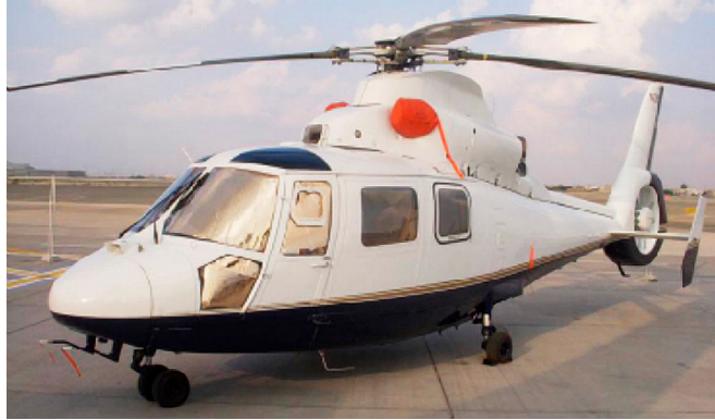
Dauphin HeatShield Set

foam with a silver mylar finish. The semi-rigid design is stiff enough to stand along the inside of the windshield using sun visors or window framing. It folds up flat and easily stores in the included storage sleeve. Some designs may require velcro and suction cups. A Heatshield is an excellent short-term remedy for cockpit overheating.