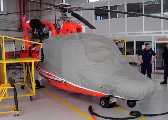
MH-65C Bubble Cover, extended Nose/Radome Model, padded over windows, P/N: A365-210

This cover type is made from Silver Acrylic Sunbrella canvas and is 100% lined with a soft and smooth microfiber. Bruce's Custom Covers developed this material combination especially for aircraft protection. The outer material is medium weight and treated for water resistance, UV resistance and anti-static buildup. The inner lining is a very soft and smooth microfiber to prevent scratching. The material is very reflective, and tests show that the cabin interior temperature can be reduced to near-ambient temperature on the hottest of days. It is water, ice and snow repellent, yet breathable to allow moisture to escape from between the cover and the aircraft surface.