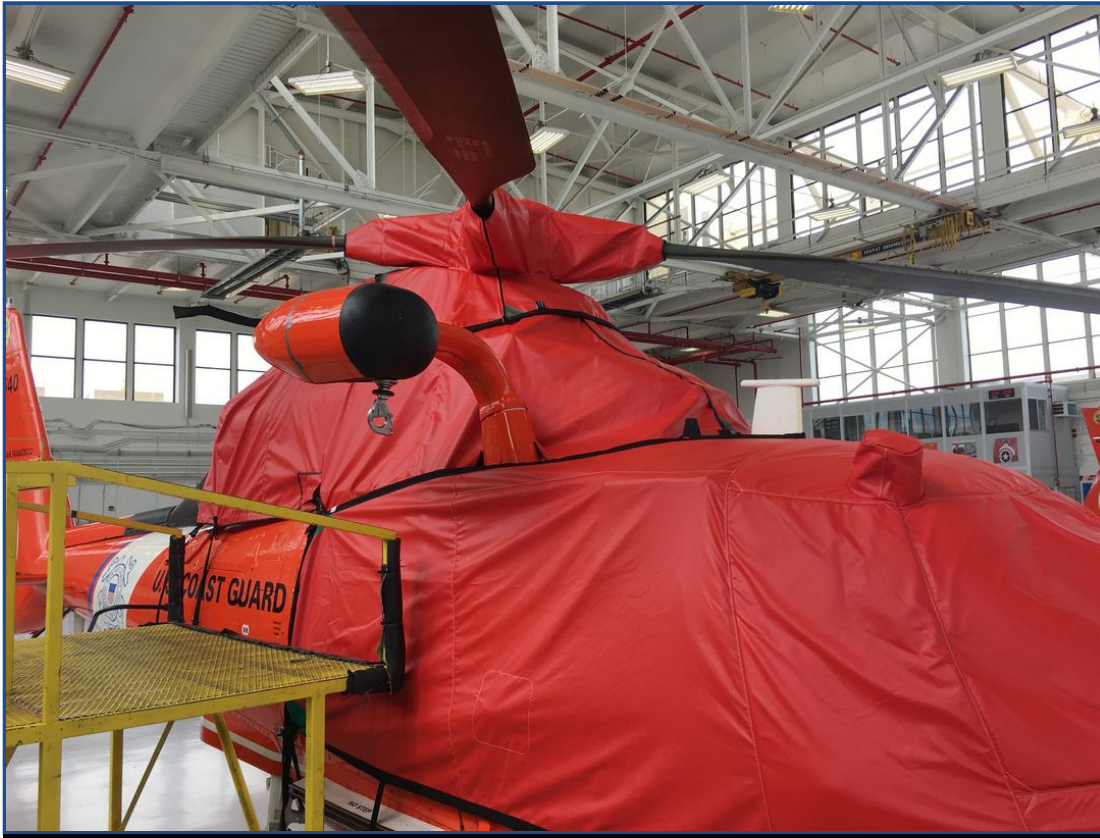
U.S. Coast Guard HH-65 Dolphin Bubble, Engine &amp; Rotor Mast Covers