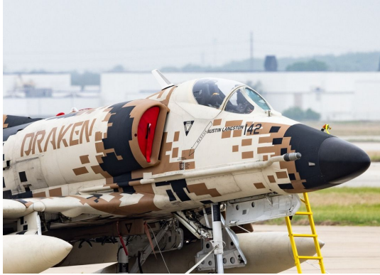
McDonnell Douglas A4 Skyhawk Engine Intake Plugs

The Engine Inlet Plugs are custom fit for your McDonnell Douglas A-4 Skyhawk, single & tandem intakes, made with heavy-duty vinyl material, and stuffed with a single block of sculpted urethane foam. Each plug has a zipper that allows the foam to be removed and dried if necessary. Engine plugs have 'remove before flight' streamers sewn onto the face of the plugs. Most plugs are imprinted with the aircraft registration number in black for an extra charge. Storage bag NOT included. Engine plugs may be inserted after flight when the engine is still warm. Engine Inlet Plugs are commonly referred to as Cowl Plugs, Intake Plugs, Cowl Blocks, Engine Blocks, and Engine Bunges.