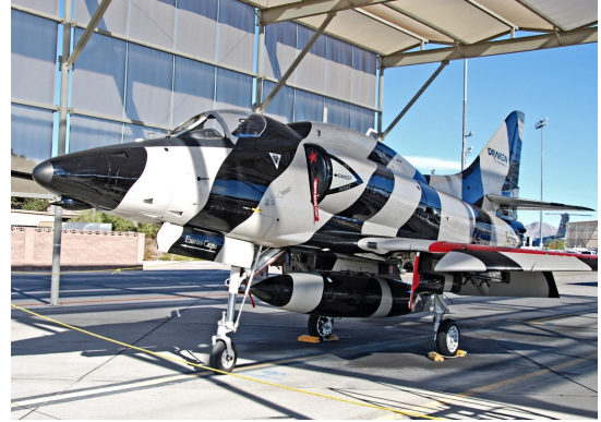
A4 Skyhawk Engine Inlet Plugs