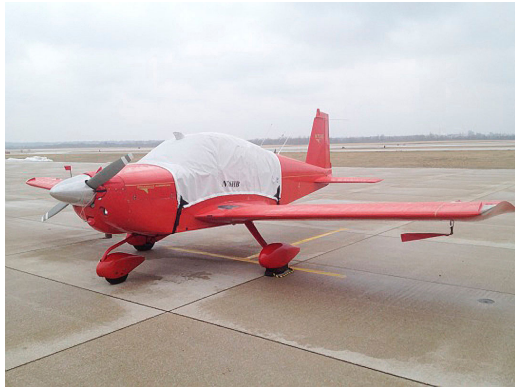
AA1 Canopy Cover, Engine Plugs

and dried if necessary. Engine plugs have warning flags that are visible from the cockpit or 'remove before flight' streamers sewn onto the face of the plugs. Most plugs are imprinted with the aircraft registration number in black for an extra charge. Storage bag NOT included. Engine plugs may be inserted after flight when the engine is still warm. Engine Inlet Plugs are commonly referred to as Cowl Plugs, Intake Plugs, Cowl Blocks, Engine Blocks, and Engine Bungs.