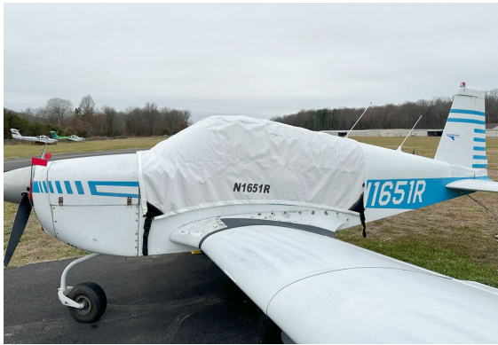
Grumman AA1 Canopy Cover

This cover type is made from Silver Acrylic Sunbrella canvas and is 100% lined with a soft and smooth microfiber. Bruce's Custom Covers developed this material combination especially for aircraft protection. The outer material is medium weight and treated for water resistance, UV resistance and anti-static buildup. The inner lining is a very soft and smooth microfiber to prevent scratching. The material is very reflective, and tests show that the cabin interior temperature can be reduced to near-ambient temperature on the hottest of days. It is water, ice and snow repellent, yet breathable to allow moisture to escape from between the cover and the aircraft surface.