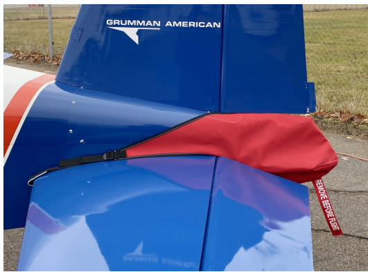
Grumman AA-1 Tailcone Cover

WINTER USE MATERIAL - Made with Solution-Dyed Polyester fabric, this option is intended for seasonal use to aid in deicing, rain mitigation, or for occasional travel. The material is lighter and more compact, but more susceptible to UV damage and may have a shorter useful life if used continuously outside than the all-year use material.