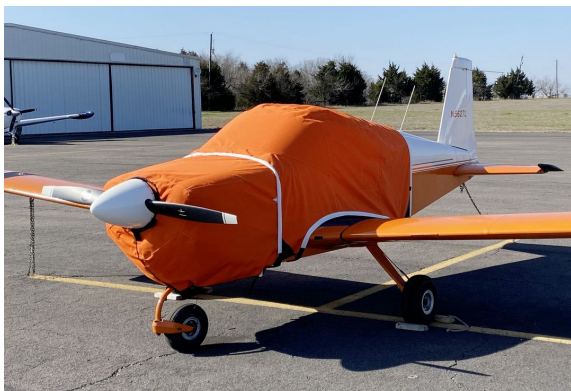
AA-1 Extended Canopy & Fully Enclosed Engine Cover

This cover type is made from Silver Acrylic Sunbrella canvas and is 100% lined with a soft and smooth microfiber. Bruce's Custom Covers developed this material combination especially for aircraft protection. The outer material is medium weight and treated for water resistance, UV resistance and anti-static buildup. The inner lining is a very soft and smooth microfiber to prevent scratching. The material is very reflective, and tests show that the cabin interior temperature can be reduced to near-ambient temperature on the hottest of days. It is water, ice and snow repellent, yet breathable to allow moisture to escape from between the cover and the aircraft surface.