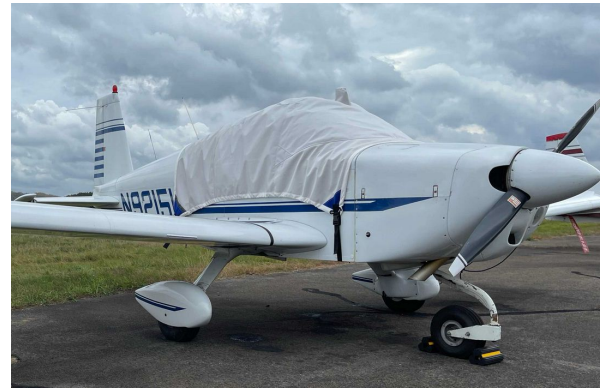
Grumman AA-1A Canopy Cover