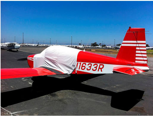
Grumman AA1 Extended Canopy Cover

This cover type is made from Silver Acrylic Sunbrella canvas and is 100% lined with a soft and smooth microfiber. Bruce's Custom Covers developed this material combination especially for aircraft protection. The outer material is medium weight and treated for water resistance, UV resistance and anti-static buildup. The inner lining is a very soft and smooth microfiber to prevent scratching. The material is very reflective, and tests show that the cabin interior temperature can be reduced to near-ambient temperature on the hottest of days. It is water, ice and snow repellent, yet breathable to allow moisture to escape from between the cover and the aircraft surface.