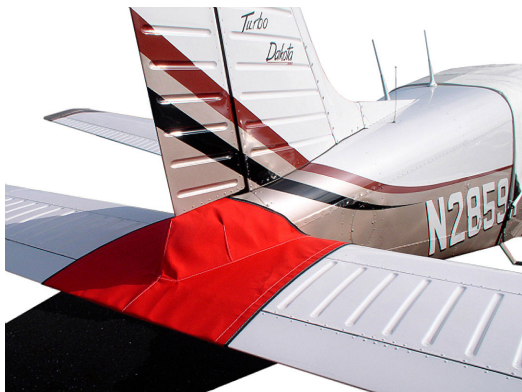
Piper PA-28 Tailcone Cover

WINTER USE MATERIAL - Made with Solution-Dyed Polyester fabric, this option is intended for seasonal use to aid in deicing, rain mitigation, or for occasional travel. The material is lighter and more compact, but more susceptible to UV damage and may have a shorter useful life if used continuously outside than the all-year use material.