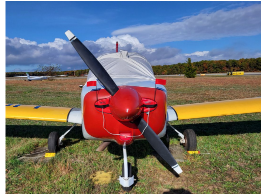
Grumman AA-1A Lynx Engine Inlet Plugs