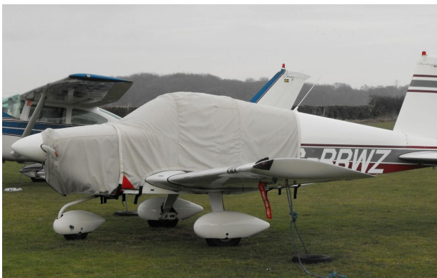
Grumman AA1 Extended Canopy Cover, Engine Cover

This cover type is made from Silver Acrylic Sunbrella canvas and is 100% lined with a soft and smooth microfiber. Bruce's Custom Covers developed this material combination especially for aircraft protection. The outer material is medium weight and treated for water resistance, UV resistance and anti-static buildup. The inner lining is a very soft and smooth microfiber to prevent scratching. The material is very reflective, and tests show that the cabin interior temperature can be reduced to near-ambient temperature on the hottest of days. It is water, ice and snow repellent, yet breathable to allow moisture to escape from between the cover and the aircraft surface.