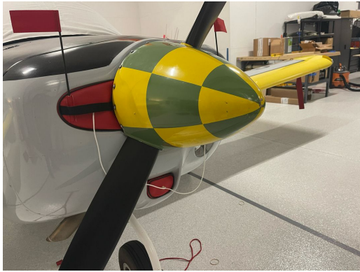
Grumman AA-1B Engine Inlet Plugs (set of 3)

and dried if necessary. Engine plugs have warning flags that are visible from the cockpit or 'remove before flight' streamers sewn onto the face of the plugs. Most plugs are imprinted with the aircraft registration number in black for an extra charge. Storage bag NOT included. Engine plugs may be inserted after flight when the engine is still warm. Engine Inlet Plugs are commonly referred to as Cowl Plugs, Intake Plugs, Cowl Blocks, Engine Blocks, and Engine Bungs.