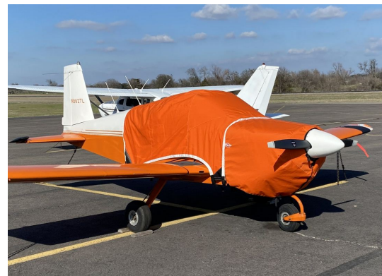
AA-1 Extended Canopy & Fully Enclosed Engine Cover