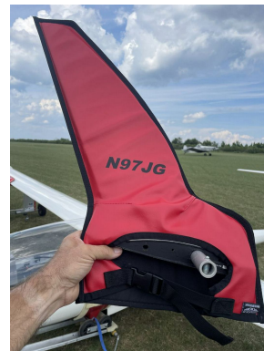
Schempp-Hirth Ventus-2B winglet/wingtip pads