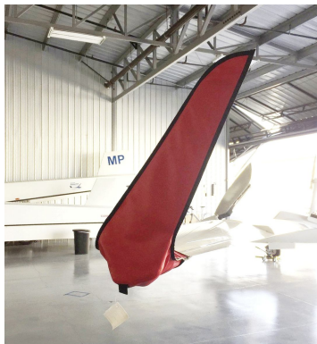
Schleicher ASH Wingtip Pads

Designed to prevent damage to the wingtip in crowded hangars or high traffic areas, these products are made of bright red Naugahyde and thickly padded with a sandwich of closed cell foam. Protects delicate winglets, casters and their housings, and soft finishes.