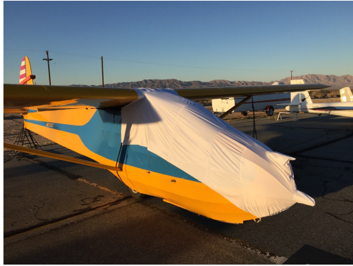
Schweizer SGU 2-22EK Canopy/Nose Cover, test fit cover