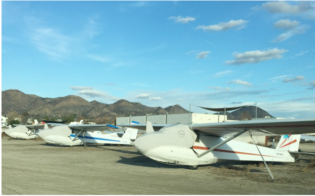
Schweizer SGS 2-33 Canopy/Nose Covers