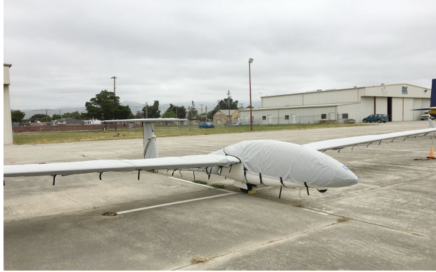
DG-505 Canopy/Nose, Wing, Empennage & Horiz. Stab. Covers

WINTER USE MATERIAL - Made with Solution-Dyed Polyester fabric, this option is intended for seasonal use to aid in deicing, rain mitigation, or for occasional travel. The material is lighter and more compact, but more susceptible to UV damage and may have a shorter useful life if used continuously outside than the all-year use material.