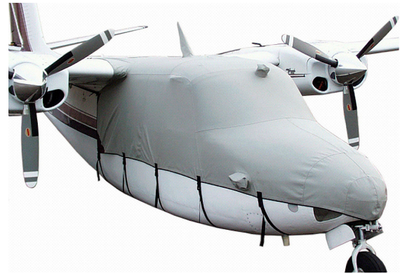
Canopy/Nose Cover (extends over top past leading edge)