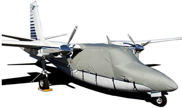
Aero Commander 500S Canopy/Nose Cover

Travel Covers are made with Silver Solution-Dyed Polyester fabric and only lined over the windshield to save weight. The material is lightweight and more compact for easy stowage in the aircraft. The polyester material is water resistant, but only intended for occasional use outside. We also have an ultra lightweight material available for fitted hangar dust covers. For daily outdoor use, the non-travel Sunbrella Cover is the best choice.