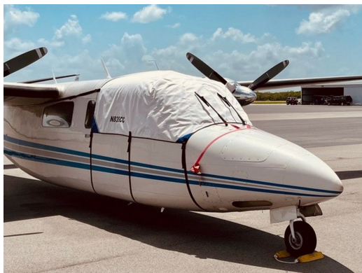
Aero Commander 690C Cockpit Cover