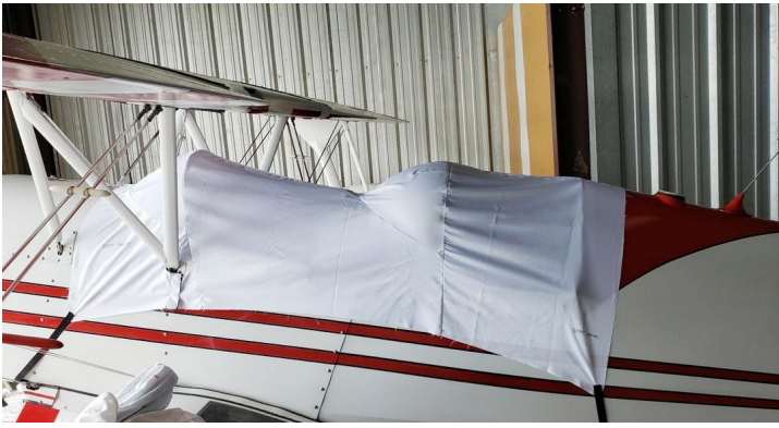
Acro Sport 2 Canopy Cover, test fit cover