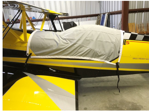
Acro Sport Acro II, Acroduster Travel Cover, Light Weight Travel Canopy Cover