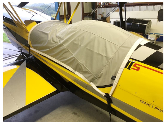
Acro Sport Acro II, Acroduster Travel Cover, Light Weight Travel Canopy Cover