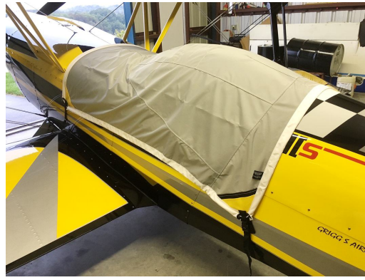
Acro Sport Acro II, Acroduster Travel Cover, Light Weight Travel Canopy Cover