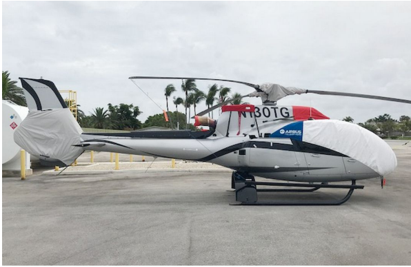
AIRBUS H130 T2, Intake, Exhaust & Tailfan Covers

some air circulation and drainage in freezing weather. Some part numbers have features for an extra charge.