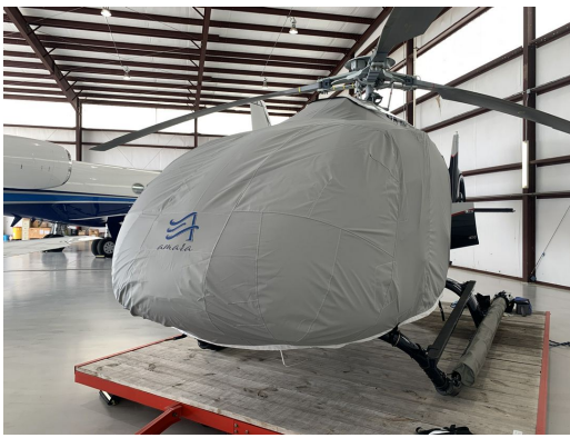
Airbus H-130 Bubble Cover, Travel Weight