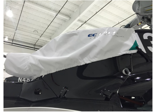
EC-130 Engine Area/Exhaust Cover