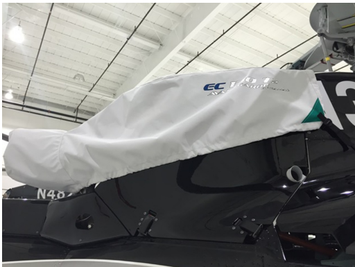
EC-130 Engine Area/Exhaust Cover

The Engine Exhaust Plugs are custom fit for your Airbus Helicopter H-130 exhaust openings, made with heavy-duty vinyl material, and stuffed with a single block of sculpted urethane foam. Exhaust plugs have 'Remove Before Flight' streamers sewn onto the face of the plugs. Exhaust plugs may be inserted soon after flight when the engine is still warm. Engine Inlet Plugs are commonly referred to as Cowl Plugs, Intake Plugs, Cowl Blocks, Engine Blocks, and Engine Bungs.