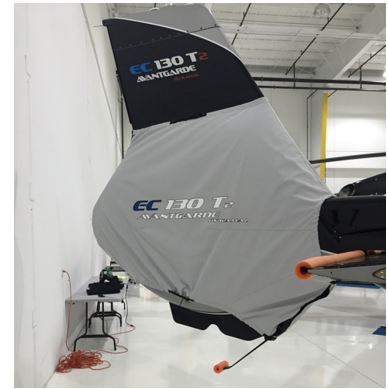
EC-130 Tailfan Cover