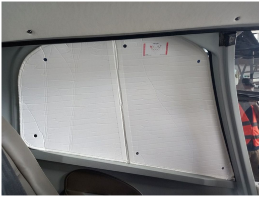
Airbus Helicopter EC130 B4 Side Window Heatshields