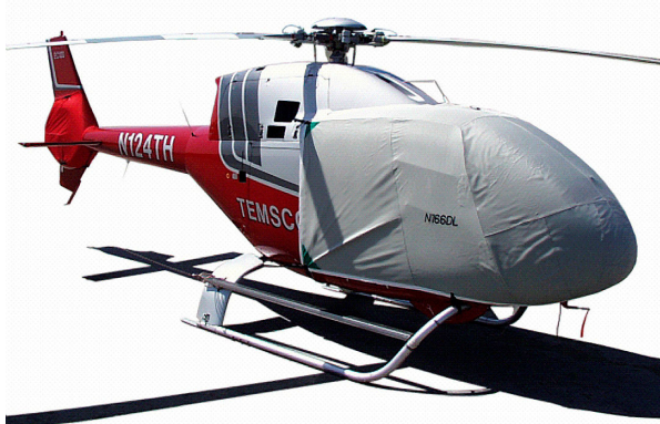
Eurocopter EC-120 Bubble Cover & Tailfan Cover

This cover type is made from Silver Acrylic Sunbrella canvas and is 100% lined with a soft and smooth microfiber. Bruce's Custom Covers developed this material combination especially for aircraft protection. The outer material is medium weight and treated for water resistance, UV resistance and anti-static buildup. The inner lining is a very soft and smooth microfiber to prevent scratching. The material is very reflective, and tests show that the cabin interior temperature can be reduced to near-ambient temperature on the hottest of days. It is water, ice and snow repellent, yet breathable to allow moisture to escape from between the cover and the aircraft surface.