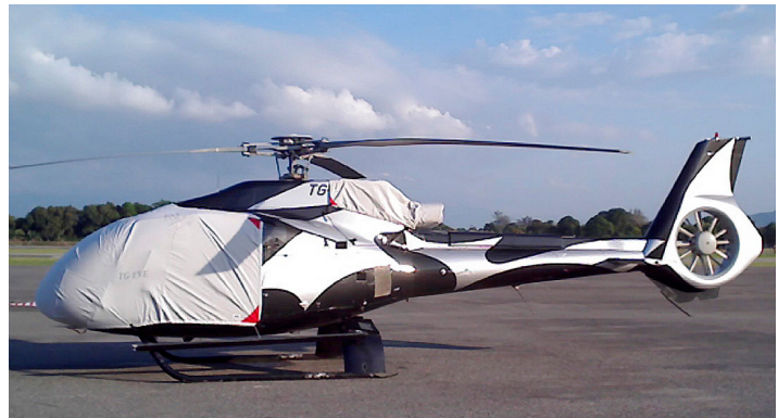
Bubble Cover and Intake/Exhaust Cover