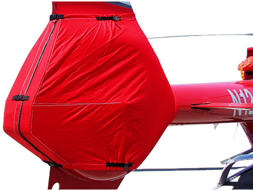
Eurocopter EC-120 Tailfan Cover

The Tailboom Cover details vary by model, but generally the helicopter tail boom cover encloses the tail boom from the "bottleneck" to the aft end. They usually also cover the horizontal stabilizers, and are custom made to allow for antennae, lights, and other protrusions. They attach with straps underneath the tail boom. Covers for the vertical and horizontal stabilizers are also available separately. Specific information for each model is available on request.