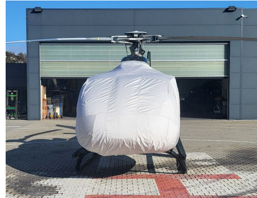
Airbus Helicopter H-130 Bubble Cover, Extends To Cover Fwd Engine Inlet