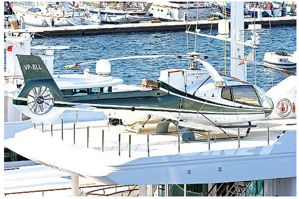
EC-130 Front, Side and Skylight Window HeatShields