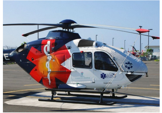
Eurocopter EC-135 Windshield/Skylight Cover