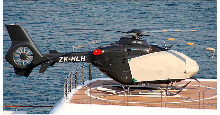
EC-135 Bubble Cover & Exhaust Plugs