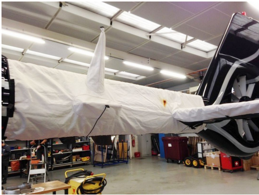
Airbus EC-135 Tailboom/Stabilizer Cover

The Tailboom Cover details vary by model, but generally the helicopter tail boom cover encloses the tail boom from the "bottleneck" to the aft end. They usually also cover the horizontal stabilizers, and are custom made to allow for antennae, lights, and other protrusions. They attach with straps underneath the tail boom. Covers for the vertical and horizontal stabilizers are also available separately. Specific information for each model is available on request.