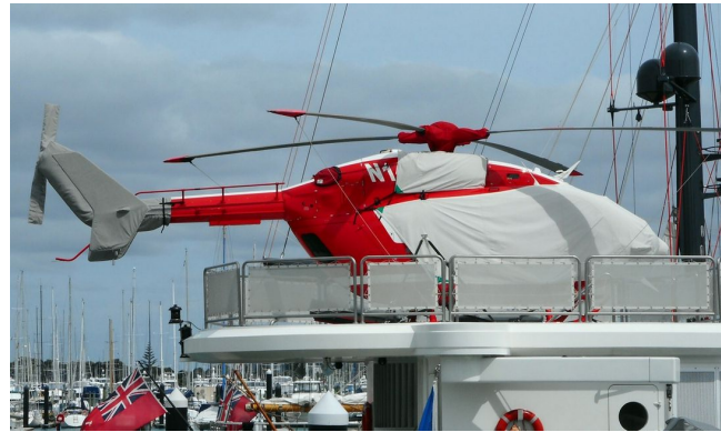
Eurocopter EC-135 Bubble, Engine, Rotor Hub, Tail Surfaces Covers