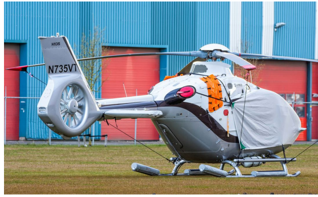
Airbus EC135T3 Blade Tie-Downs