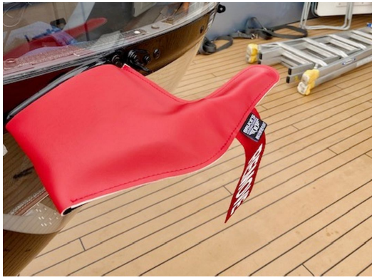
Airbus Helicopter H145 Pitot Tube Cover