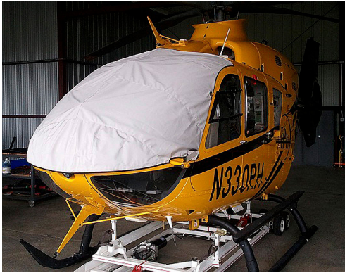
EC-135 Windshield/Skylights Cover, pinches in door jambs