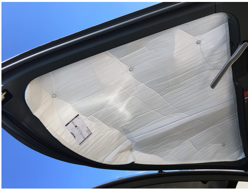
Eurocopter EC-145 Cockpit Heatshields

Heatshields are interior sunshades for an aircraft's windows or canopy glass. The product is a unique composite of closed-cell foam with a silver mylar finish. The semi-rigid design is stiff enough to stand along the inside of the windshield using sun visors or window framing. It folds up flat and easily stores in the included storage sleeve. Some designs may require velcro and suction cups. A Heatshield is an excellent short-term remedy for cockpit overheating.