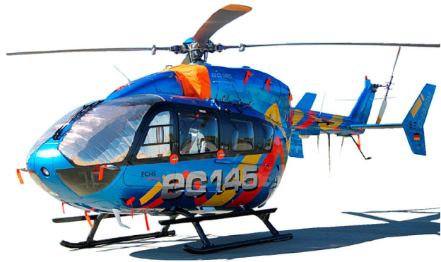
EC-145 Cabin Heatshield Set