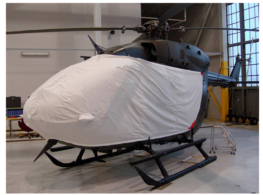
EC-145 Bubble Cover