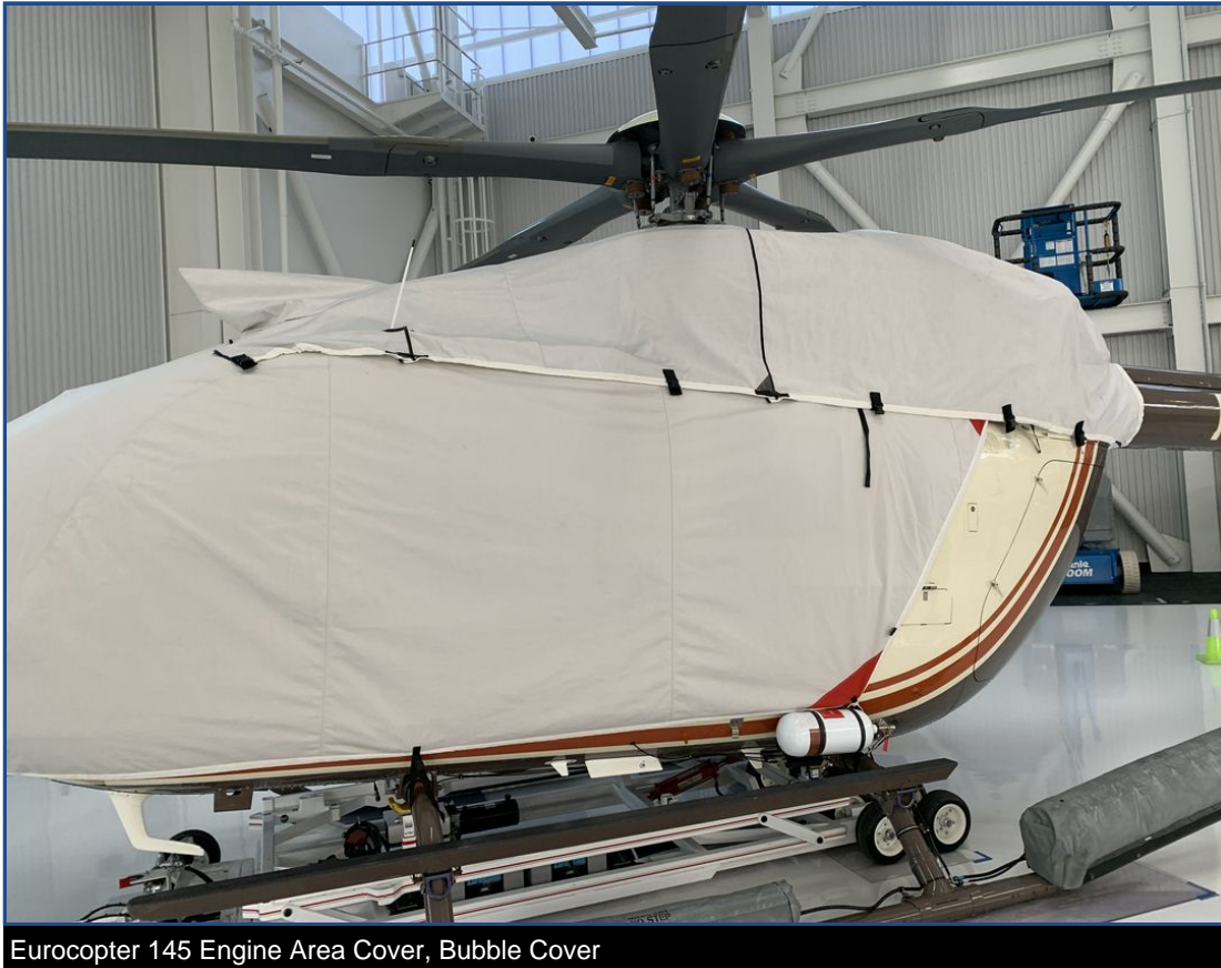
Eurocopter 145 Engine Area Cover, Bubble Cover