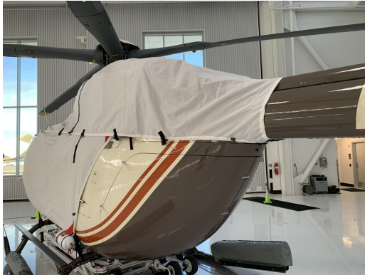
Eurocopter 145 Engine Area Cover, Bubble Cover

This cover type is made from Silver Acrylic Sunbrella canvas and is 100% lined with a soft and smooth microfiber. Bruce's Custom Covers developed this material combination especially for aircraft protection. The outer material is medium weight and treated for water resistance, UV resistance and anti-static buildup. The inner lining is a very soft and smooth microfiber to prevent scratching. The material is very reflective, and tests show that the cabin interior temperature can be reduced to near-ambient temperature on the hottest of days. It is water, ice and snow repellent, yet breathable to allow moisture to escape from between the cover and the aircraft surface.