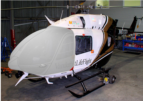
EC-145 Windshield/Nose Cover (illustration)

This cover type is made from Silver Acrylic Sunbrella canvas and is 100% lined with a soft and smooth microfiber. Bruce's Custom Covers developed this material combination especially for aircraft protection. The outer material is medium weight and treated for water resistance, UV resistance and anti-static buildup. The inner lining is a very soft and smooth microfiber to prevent scratching. The material is very reflective, and tests show that the cabin interior temperature can be reduced to near-ambient temperature on the hottest of days. It is water, ice and snow repellent, yet breathable to allow moisture to escape from between the cover and the aircraft surface.