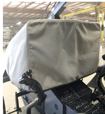
Eurocopter EC-135 Instrument Panel Heatshield Cover