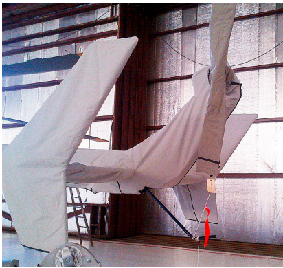
Tail Rotor Cover & Tailboom, Vertical Pylon & Stabilizers Cover

The Engine Inlet Plugs are custom fit for your Airbus Helicopter H145, UH-145, BK-117 D-2, D-3 intakes, made with heavy-duty vinyl material, and stuffed with a single block of sculpted urethane foam. Each plug has a zipper that allows the foam to be removed and dried if necessary. Engine plugs have 'Remove Before Flight' streamers sewn onto the face of the plugs. Most plugs are imprinted with the aircraft registration number in black for an extra charge. Storage bag NOT included. Engine plugs may be inserted after flight when the engine is still warm. Engine Inlet Plugs are commonly referred to as Cowl Plugs, Intake Plugs, Cowl Blocks, Engine Blocks, and Engine Bunges.