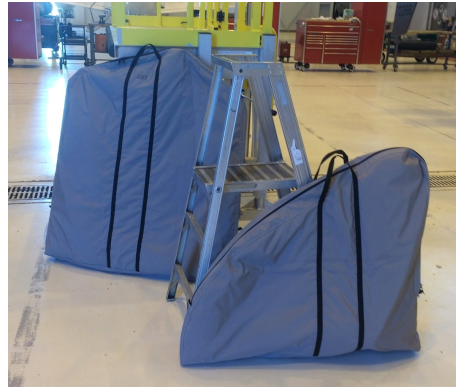
Eurocopter EC-145 Padded Bags for Removable Doors