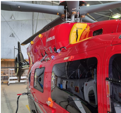
Airbus Helicopter H145D3 Intake Plugs

The Engine Inlet Plugs are custom fit for your Airbus Helicopter H145, UH-145, BK-117 D-2, D-3 intakes, made with heavy-duty vinyl material, and stuffed with a single block of sculpted urethane foam. Each plug has a zipper that allows the foam to be removed and dried if necessary. Engine plugs have 'Remove Before Flight' streamers sewn onto the face of the plugs. Most plugs are imprinted with the aircraft registration number in black for an extra charge. Storage bag NOT included. Engine plugs may be inserted after flight when the engine is still warm. Engine Inlet Plugs are commonly referred to as Cowl Plugs, Intake Plugs, Cowl Blocks, Engine Blocks, and Engine Bunges.