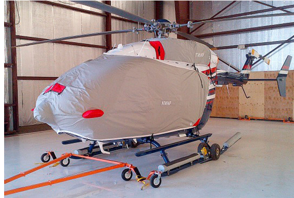
Bubble Cover w/ nose mounted radome & Upper Deck Plugs/Cover