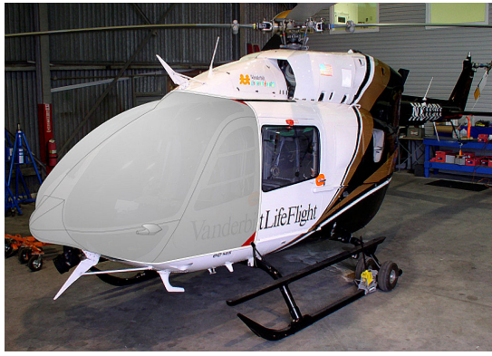
EC-145 Windshield/Nose Cover (illustration)