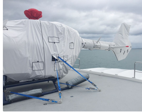
Eurocopter EC-145 D2 Main Body Cover, Tailboom/Fenestron Cover