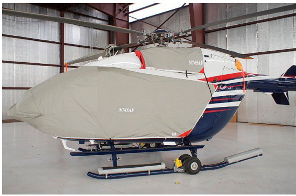
Bubble Cover w/ nose mounted radome, Upper Deck Plugs/Cover