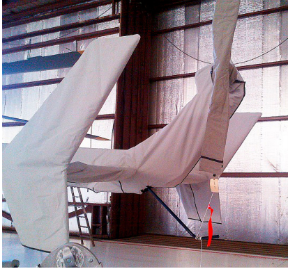
Tail Rotor Cover & Tailboom, Vertical Pylon & Stabilizers Cover

The Tailboom Cover details vary by model, but generally the helicopter tail boom cover encloses the tail boom from the "bottleneck" to the aft end. They usually also cover the horizontal stabilizers, and are custom made to allow for antennae, lights, and other protrusions. They attach with straps underneath the tail boom. Covers for the vertical and horizontal stabilizers are also available separately. Specific information for each model is available on request.