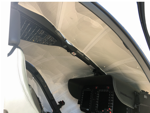
Eurocopter EC-145 Cockpit Heatshields