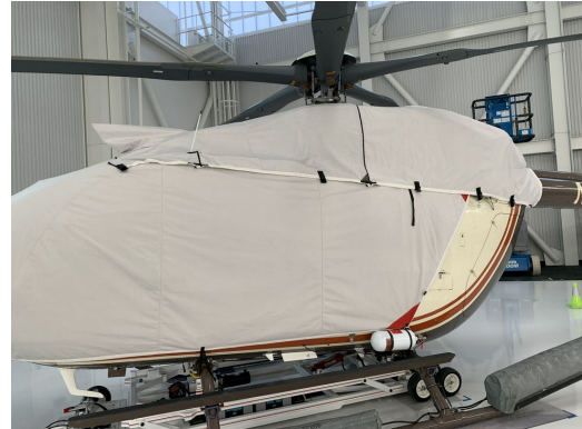
Eurocopter 145 Engine Area Cover, Bubble Cover