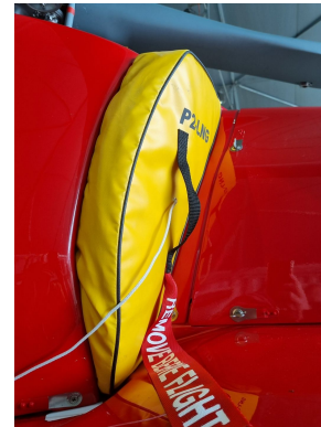
Airbus Helicopter H145D3 Intake Plugs