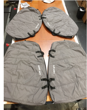
MD 500D Padded Door Bags