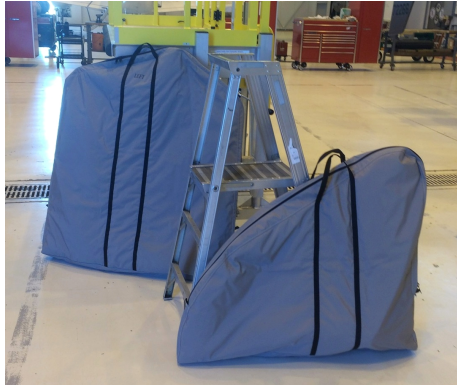
Eurocopter EC-145 Padded Bags for Removable Doors

**Padded Door Bags* are designed to provide portable protection of the doors when they are removed from the aircraft. They are padded to moderate thickness, zippered closed, and have sturdy carry handles for easy transport.