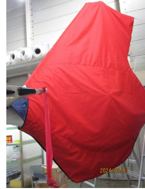
Airbus EC145 Tailfan Housing Fenestron Cover