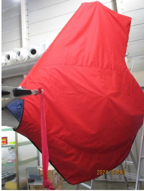
Airbus EC145 Tailfan Housing Fenestron Cover

The Tailboom Cover details vary by model, but generally the helicopter tail boom cover encloses the tail boom from the "bottleneck" to the aft end. They usually also cover the horizontal stabilizers, and are custom made to allow for antennae, lights, and other protrusions. They attach with straps underneath the tail boom. Covers for the vertical and horizontal stabilizers are also available separately. Specific information for each model is available on request.