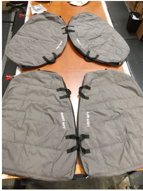
MD 500D Padded Door Bags

**Padded Door Bags* are designed to provide portable protection of the doors when they are removed from the aircraft. They are padded to moderate thickness, zippered closed, and have sturdy carry handles for easy transport.