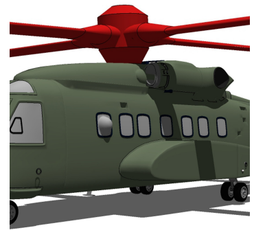
Sikorsky S-92 Main Rotor Hub Cover