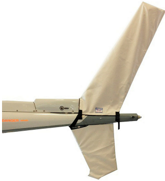
AS350B3 Vertical Stabilizers cover

The Tailboom Cover details vary by model, but generally the helicopter tail boom cover encloses the tail boom from the "bottleneck" to the aft end. They usually also cover the horizontal stabilizers, and are custom made to allow for antennae, lights, and other protrusions. They attach with straps underneath the tail boom. Covers for the vertical and horizontal stabilizers are also available separately. Specific information for each model is available on request.