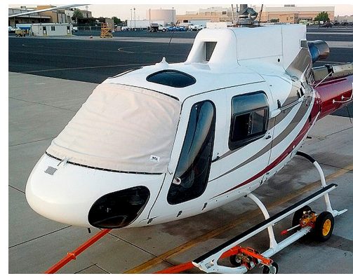
AS350 Windshield Cover, pinches in door jambs