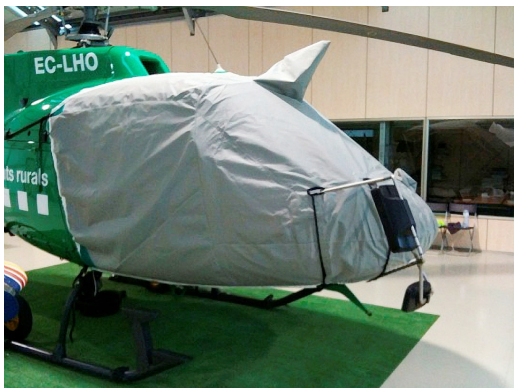
AS350 Bubble Cover with Wire Strike and Cargo Mirror

Travel Covers are made with Silver Solution-Dyed Polyester fabric and fully lined over the entire cover. The material is lightweight and more compact for easy storage in the aircraft. The polyester material is water resistant, but only intended for occasional use outside. We also have an ultra lightweight material available for fitted hangar dust covers. For daily outdoor use, the non-travel Sunbrella Cover is the best choice.