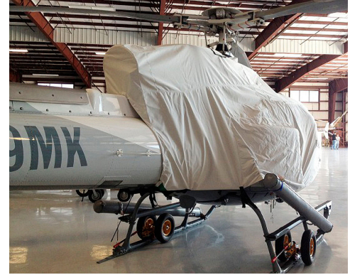
Eurocopter AS350 Main Body Cover