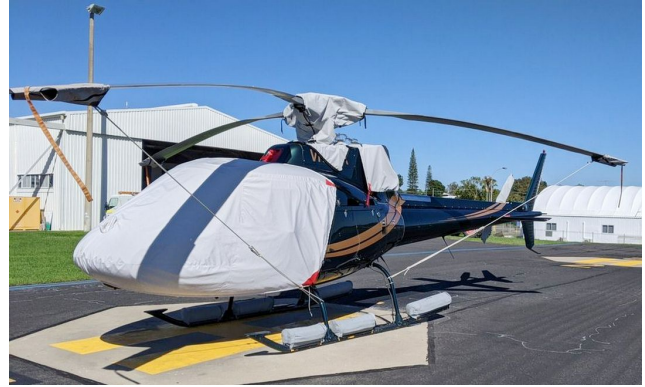
AS350 Bubble, Main Rotor, Intake & Tail Rotor Covers