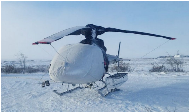
Airbus Helicopter AS350 Bubble Cover, Blade Tie-Downs, Blade Covers & Rotor Head Cover

WINTER USE MATERIAL - Made with Solution-Dyed Polyester fabric, this option is intended for seasonal use to aid in deicing, rain mitigation, or for occasional travel. The material is lighter and more compact, but more susceptible to UV damage and may have a shorter useful life if used continuously outside than the all-year use material.