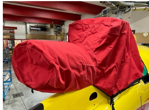
Airbus Helicopter H-125 & AS350 Intake/Exhaust Cover (newer design)