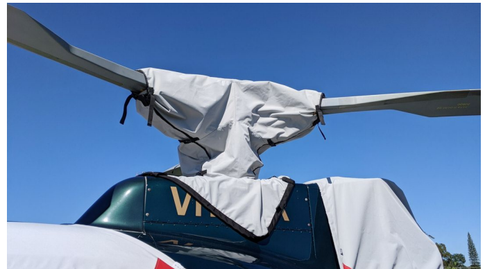
AS350 Main Rotor & Intake Covers