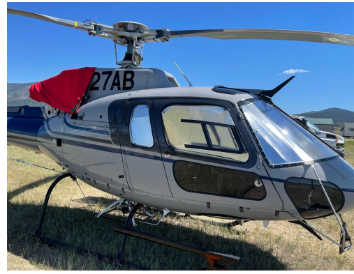
Eurocopter AS350-B3 Cabin HeatShields, Intake/Exhaust Cover Eurocopter AS350-B3 Cabin HeatShields, Intake/Exhaust Cover