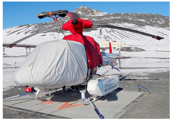
AS350 Bubble Cover w/ Cargo Mirror, Blade Tie-downs, Insulated Engine, Insulated Main Rotor Hub and Insulated Tail Rotor Covers