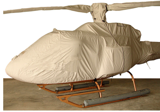
AS350 Main Body, Rotor Head, Blades and Tailboom Covers