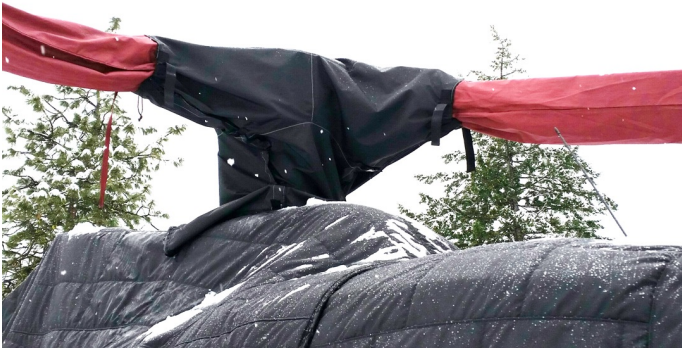
Main Rotor Hub Cover with swash plate extension.

WINTER USE MATERIAL - Made with Solution-Dyed Polyester fabric, this option is intended for seasonal use to aid in deicing, rain mitigation, or for occasional travel. The material is lighter and more compact, but more susceptible to UV damage and may have a shorter useful life if used continuously outside than the all-year use material.