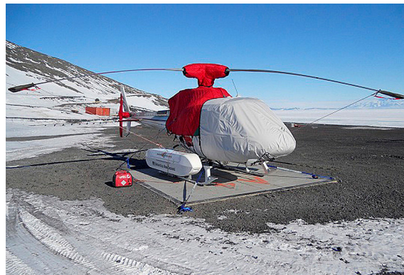
AS350 Bubble Cover w/ Cargo Mirror, Blade Tie-downs, Insulated Engine, Insulated Main Rotor Hub & Insulated Tail Rotor Covers