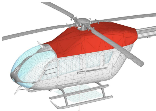
Intake/Exhaust Engine Area Cover, 3D Rendering

The Engine Inlet Plugs are custom fit for your Airbus Helicopter UH-72A intakes, made with heavy-duty vinyl material, and stuffed with a single block of sculpted urethane foam. Each plug has a zipper that allows the foam to be removed and dried if necessary. Engine plugs have 'Remove Before Flight' streamers sewn onto the face of the plugs. Most plugs are imprinted with the aircraft registration number in black for an extra charge. Storage bag NOT included. Engine plugs may be inserted after flight when the engine is still warm. Engine Inlet Plugs are commonly referred to as Cowl Plugs, Intake Plugs, Cowl Blocks, Engine Blocks, and Engine Bungs.