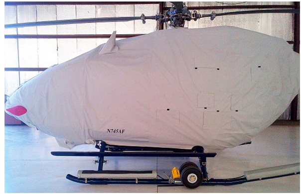
Eurocopter EC-145 Main Body Cover, also covers the bottom belly