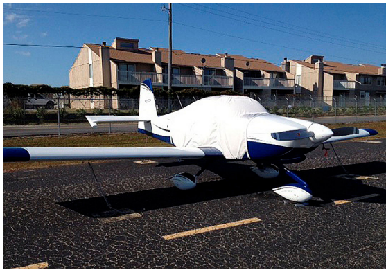
Van's RV-10 Extended Canopy Cover

This cover type is made from Silver Acrylic Sunbrella canvas and is 100% lined with a soft and smooth microfiber. Bruce's Custom Covers developed this material combination especially for aircraft protection. The outer material is medium weight and treated for water resistance, UV resistance and anti-static buildup. The inner lining is a very soft and smooth microfiber to prevent scratching. The material is very reflective, and tests show that the cabin interior temperature can be reduced to near-ambient temperature on the hottest of days. It is water, ice and snow repellent, yet breathable to allow moisture to escape from between the cover and the aircraft surface.