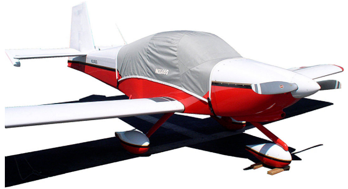
Van's RV-10 Canopy Cover