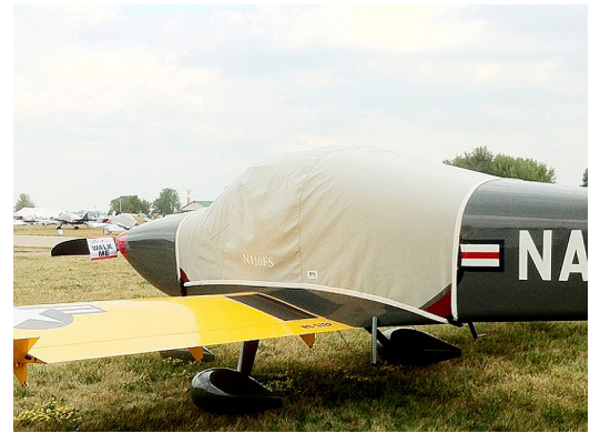
Van's RV-10 Canopy Cover