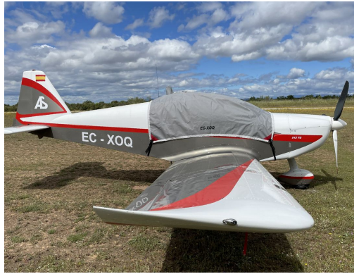
Direct Fly Alto Travel Cover, Light Weight Canopy Cover

Travel Covers are made with Silver Solution-Dyed Polyester fabric and only lined over the windshield to save weight. The material is lightweight and more compact for easy stowage in the aircraft. The polyester material is water resistant, but only intended for occasional use outside. We also have an ultra lightweight material available for fitted hangar dust covers. For daily outdoor use, the non-travel Sunbrella Cover is the best choice.