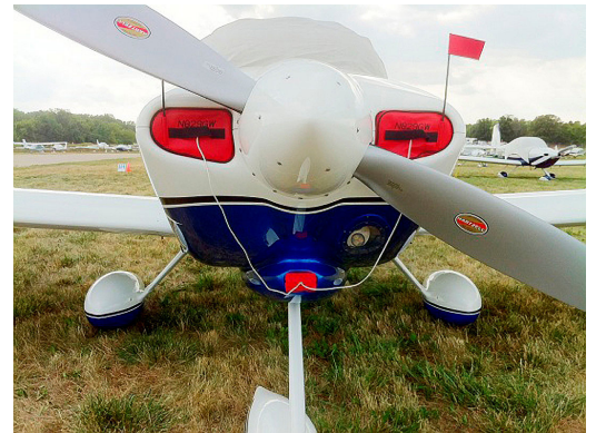
Van's RV-10 Canopy Cover & Engine Inlet Plugs