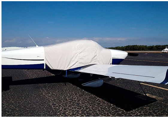
Van's RV-10 Extended Canopy Cover

This cover type is made from Silver Acrylic Sunbrella canvas and is 100% lined with a soft and smooth microfiber. Bruce's Custom Covers developed this material combination especially for aircraft protection. The outer material is medium weight and treated for water resistance, UV resistance and anti-static buildup. The inner lining is a very soft and smooth microfiber to prevent scratching. The material is very reflective, and tests show that the cabin interior temperature can be reduced to near-ambient temperature on the hottest of days. It is water, ice and snow repellent, yet breathable to allow moisture to escape from between the cover and the aircraft surface.