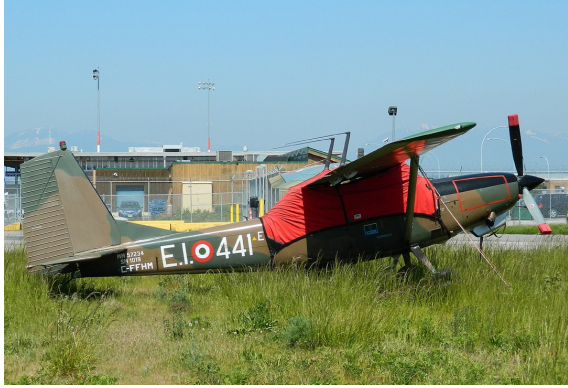
Cessna L-19 Bird Dog Canopy Cover

The material is very reflective, and tests show that the cabin interior temperature can be reduced to near-ambient temperature on the hottest of days. It is water, ice and snow repellent, yet breathable to allow moisture to escape from between the cover and the aircraft surface.