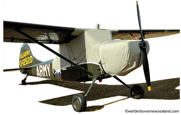
Cessna L-19 Canopy & Engine Covers