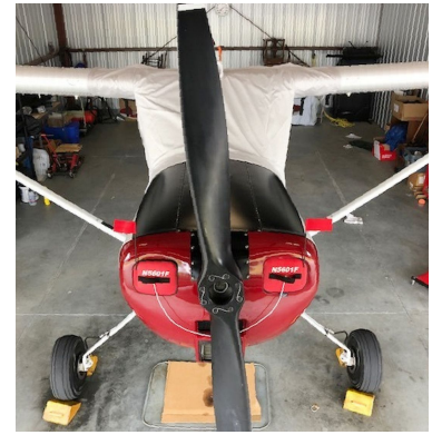
Cessna Bird Dog, L-19, O-1, 305 Engine Inlet Plugs