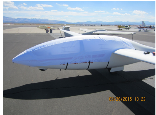
DG-505 Canopy/Nose Cover (test fit cover)