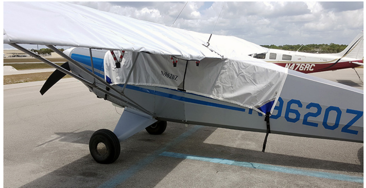
Aviat (Christen) Husky Wing Covers, All Year Use