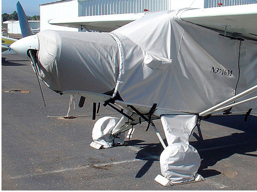
Piper PA-12 Landing Gear Covers

ALL-YEAR USE MATERIAL - Made with Silver Acrylic Sunbrella canvas, the all-year use material is the best option for sun protection and cover longevity. This heavier more durable material is intended for all weather conditions, such as rain and snow or lots of sun.