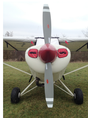
Aviat Husky Engine Plugs, Wing Covers