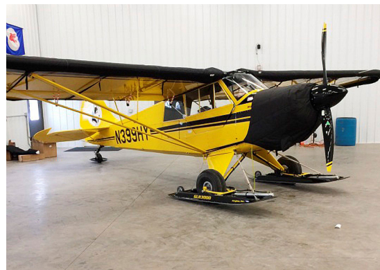
Aviat Husky Insulated Engine Cover, Wing Covers