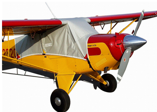
Aviat Husky Canopy Cover & Engine Plugs

Engine Inlet Plugs are custom fit for your Normand Dube Aerocruiser intakes, made with heavy-duty vinyl material, and stuffed with a single block of sculpted urethane foam. Each plug has a zipper that allows the foam to be removed and dried if necessary. Engine plugs have warning flags that are visible from the cockpit or 'remove before flight' streamers sewn onto the face of the plugs. Most plugs are imprinted with the aircraft registration number in black for an extra charge. Storage bag NOT included. Engine plugs may be inserted after flight when the engine is still warm. Engine Inlet Plugs are commonly referred to as Cowl Plugs, Intake Plugs, Cowl Blocks, Engine Blocks, and Engine Bungs.