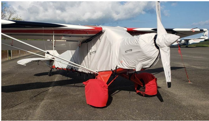
Aviat Husky Extended Canopy Cover, Engine, Prop, Empennage & Tire Covers

This cover type is made from Silver Acrylic Sunbrella canvas and is 100% lined with a soft and smooth microfiber. Bruce's Custom Covers developed this material combination especially for aircraft protection. The outer material is medium weight and treated for water resistance, UV resistance and anti-static buildup. The inner lining is a very soft and smooth microfiber to prevent scratching. The material is very reflective, and tests show that the cabin interior temperature can be reduced to near-ambient temperature on the hottest of days. It is water, ice and snow repellent, yet breathable to allow moisture to escape from between the cover and the aircraft surface.