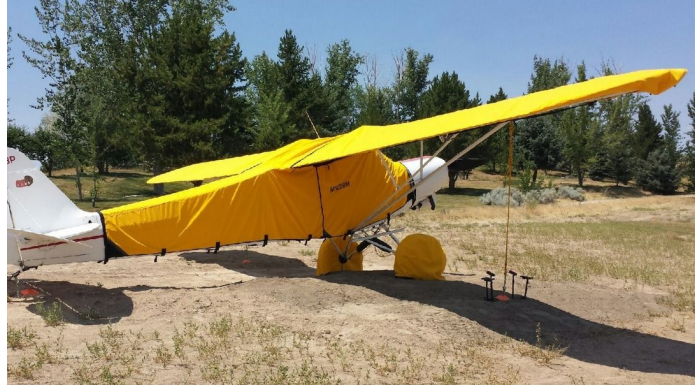
Piper PA-18 Super Cub Extended Canopy Cover, Wing & Tire Covers