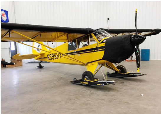
Aviat Husky Insulated Engine Cover, Wing Covers

WINTER USE MATERIAL - Made with Solution-Dyed Polyester fabric, this option is intended for seasonal use to aid in deicing, rain mitigation, or for occasional travel. The material is lighter and more compact, but more susceptible to UV damage and may have a shorter useful life if used continuously outside than the all-year use material.