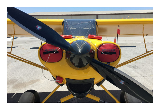
Cub Crafters CC-11 Carbon Cub Engine Plugs