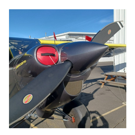
CubCrafters FX-3 Engine Inlet Plugs

Engine Inlet Plugs are custom fit for your Lewaero Ascender intakes, made with heavy-duty vinyl material, and stuffed with a single block of sculpted urethane foam. Each plug has a zipper that allows the foam to be removed and dried if necessary. Engine plugs have warning flags that are visible from the cockpit or 'remove before flight' streamers sewn onto the face of the plugs. Most plugs are imprinted with the aircraft registration number in black for an extra charge. Storage bag NOT included. Engine plugs may be inserted after flight when the engine is still warm. Engine Inlet Plugs are commonly referred to as Cowl Plugs, Intake Plugs, Cowl Blocks, Engine Blocks, and Engine Bungs.