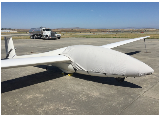
Schleicher ASK-21 Canopy/Nose Cover