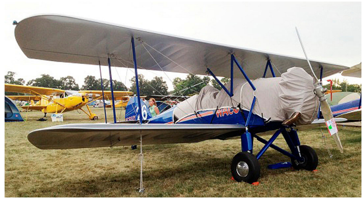
Waco ASO Canopy/Cockpit and Engine Cover