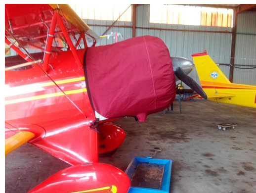
Waco Engine Cover