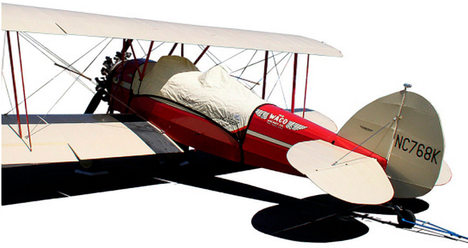
Waco 10 Canopy Cover