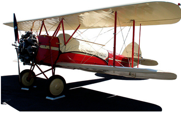
Waco 10 Canopy Cover