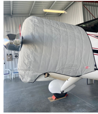
Stinson Reliant V-77, SR, AT-19 Insulated Engine Cover