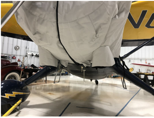
Stinson Reliant SR-10 Insulated Engine Cover