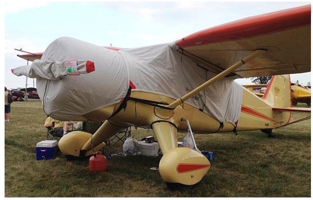
Stinson Reliant Over-the-top Canopy, Engine, and Propeller Cover