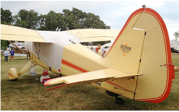
Stinson Reliant Over-the-top Canopy Cover