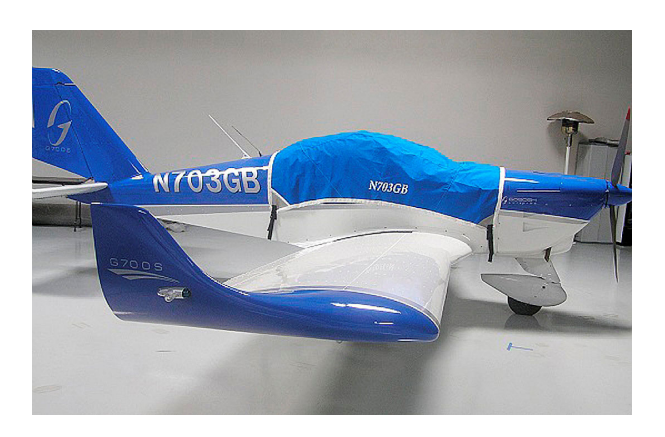
Gobosh Canopy Cover