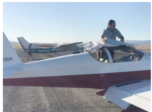
Van's RV-6A Canopy Cover