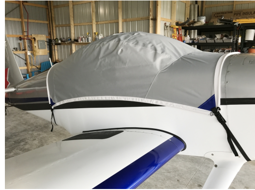
Van's Aircraft RV-9 Travel Cover, Light Weight Travel Canopy Cover