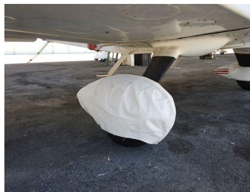
Grumman AA5 Main Wheelpant Cover, test fit