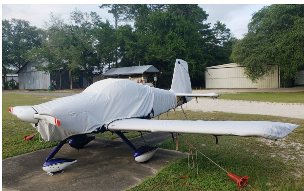
Van's RV-7A Cover Set