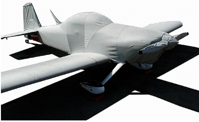
Van's RV-4 Complete Cover