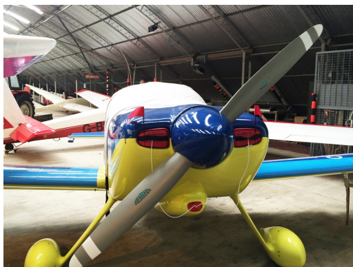
Van's RV-6 Engine Inlet Plugs

Engine Inlet Plugs are custom fit for your Aura Aero Integral R intakes, made with heavy-duty vinyl material, and stuffed with a single block of sculpted urethane foam. Each plug has a zipper that allows the foam to be removed and dried if necessary. Engine plugs have warning flags that are visible from the cockpit or 'remove before flight' streamers sewn onto the face of the plugs. Most plugs are imprinted with the aircraft registration number in black for an extra charge. Storage bag NOT included. Engine plugs may be inserted after flight when the engine is still warm. Engine Inlet Plugs are commonly referred to as Cowl Plugs, Intake Plugs, Cowl Blocks, Engine Blocks, and Engine Bung.