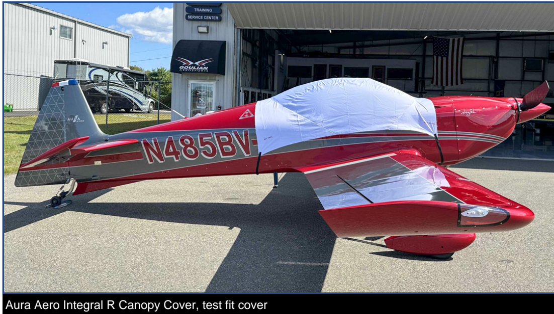
Aura Aero Integral R Canopy Cover, test fit cover