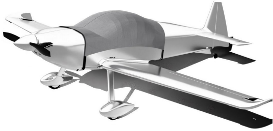
Aura Integral R Canopy Cover, 3D model

Travel Covers are made with Silver Solution-Dyed Polyester fabric and only lined over the windshield to save weight. The material is lightweight and more compact for easy stowage in the aircraft. The polyester material is water resistant, but only intended for occasional use outside. We also have an ultra lightweight material available for fitted hangar dust covers. For daily outdoor use, the non-travel Sunbrella Cover is the best choice.