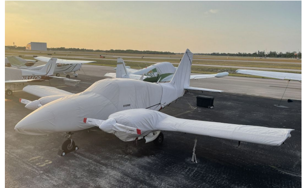
Piper Aztec Complete Cover Set