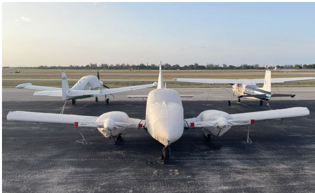
Piper Aztec Complete Cover Set

WINTER USE MATERIAL - Made with Solution-Dyed Polyester fabric, this option is intended for seasonal use to aid in deicing, rain mitigation, or for occasional travel. The material is lighter and more compact, but more susceptible to UV damage and may have a shorter useful life if used continuously outside than the all-year use material.