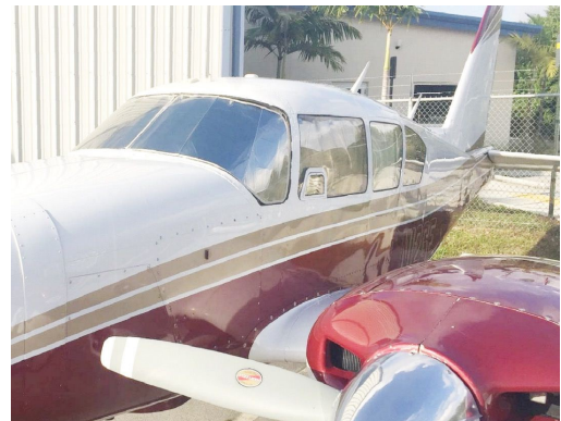
Piper Aztec HeatShield Set