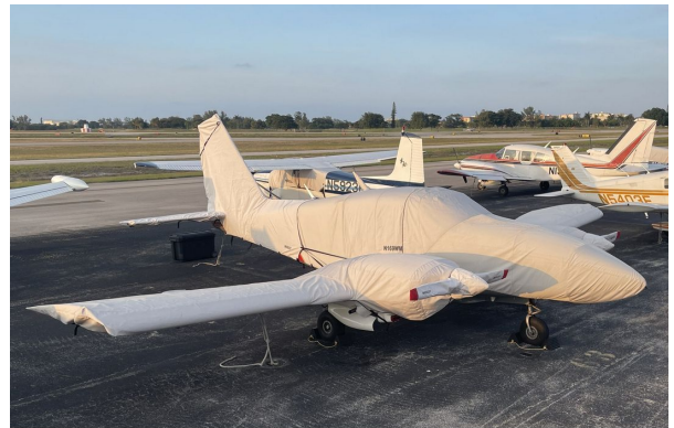
Piper Aztec Complete Cover Set