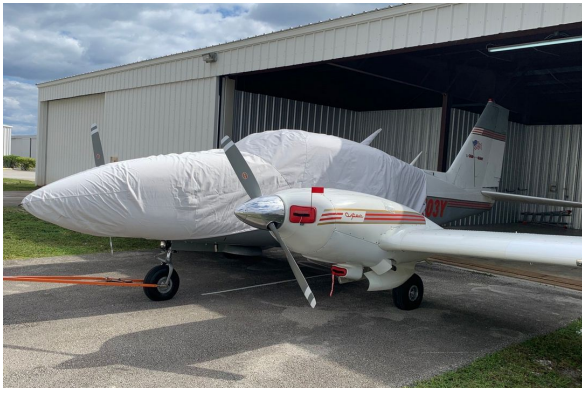
Piper Aztec Extended Canopy/Nose Cover, Engine Plugs