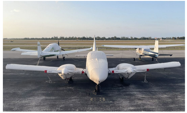
Piper Aztec Complete Cover Set