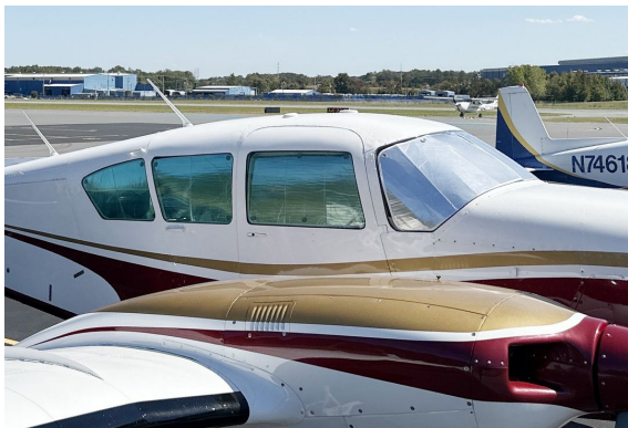
Piper Aztec HeatShields

Windshield Heatshields are interior sunshades for an aircraft's front windshield. The product is a unique composite of closed-cell foam with a silver mylar finish. The semi-rigid design is stiff enough to stand along the inside of the windshield using sun visors or window framing. It folds up flat and easily stores in the included storage sleeve. Some designs may require velcro and suction cups or split right and left sides. A Heatshield is an excellent short-term remedy for cockpit overheating. An external fabric cover is far more effective and practical for long-term protection.