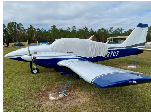
Piper PA-23-250 Aztec Canopy cover