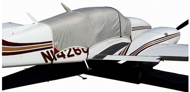
Standard Aztec Canopy Cover