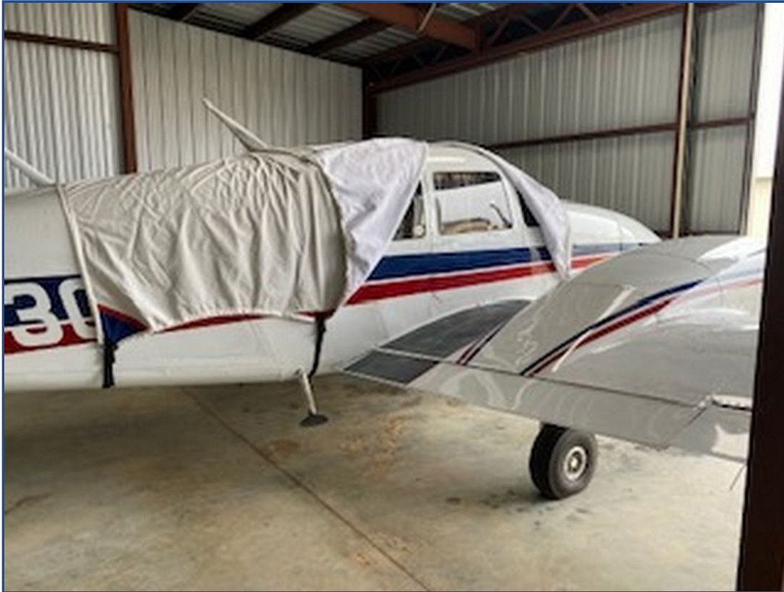
Piper PA-23 Aztec Canopy cover