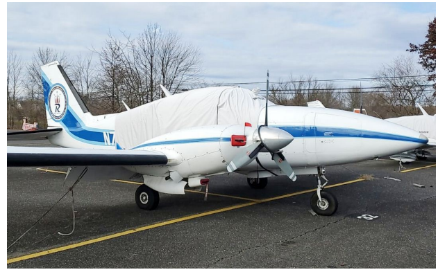
Piper Aztec Canopy Cover, Engine Plugs