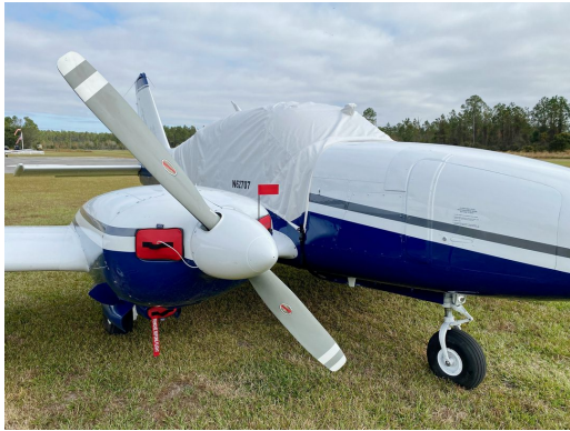
Piper PA-23-250 Aztec Inlet plugs

are imprinted with the aircraft registration number in black for an extra charge. Storage bag NOT included. Engine plugs may be inserted after flight when the engine is still warm. Engine Inlet Plugs are commonly referred to as Cowl Plugs, Intake Plugs, Cowl Blocks, Engine Blocks, and Engine Bungs.