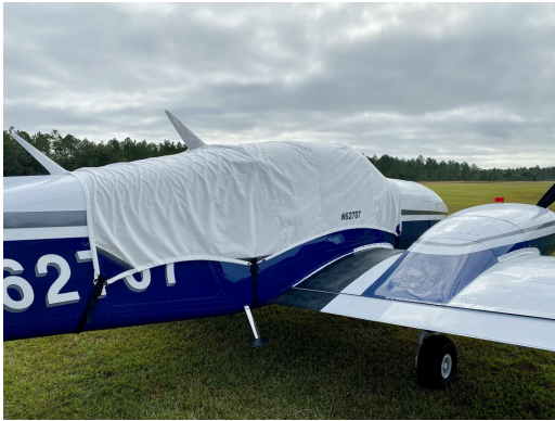
Piper PA-23-250 Aztec Canopy cover

are imprinted with the aircraft registration number in black for an extra charge. Storage bag NOT included. Engine plugs may be inserted after flight when the engine is still warm. Engine Inlet Plugs are commonly referred to as Cowl Plugs, Intake Plugs, Cowl Blocks, Engine Blocks, and Engine Bunges.