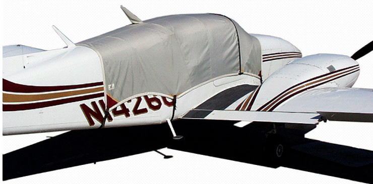
Standard Aztec Canopy Cover

Travel Covers are made with Silver Solution-Dyed Polyester fabric and only lined over the windshield to save weight. The material is lightweight and more compact for easy stowage in the aircraft. The polyester material is water resistant, but only intended for occasional use outside. We also have an ultra lightweight material available for fitted hangar dust covers. For daily outdoor use, the non-travel Sunbrella Cover is the best choice.