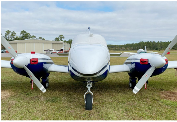
Piper PA-23-250 Aztec Inlet plugs