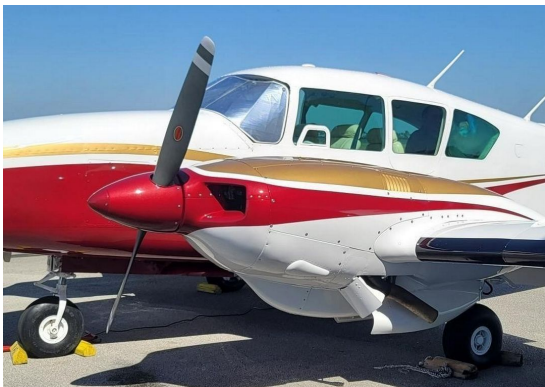
Piper Aztec Windshield HeatShield

Windshield Heatshields are interior sunshades for an aircraft's front windshield. The product is a unique composite of closed-cell foam with a silver mylar finish. The semi-rigid design is stiff enough to stand along the inside of the windshield using sun visors or window framing. It folds up flat and easily stores in the included storage sleeve. Some designs may require velcro and suction cups or split right and left sides. A Heatshield is an excellent short-term remedy for cockpit overheating. An external fabric cover is far more effective and practical for long-term protection.