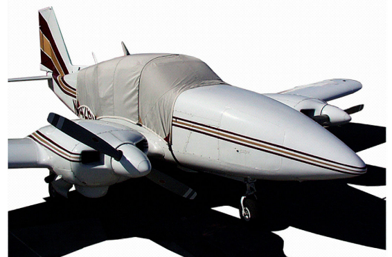
Aztec Canopy Cover