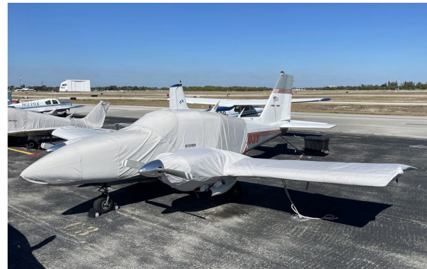
Piper Aztec Extended Canopy/Nose & Wing/Engine Covers