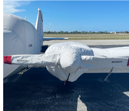
Piper Aztec Propellor Cover