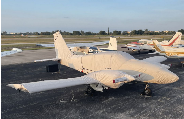
Piper Aztec Complete Cover Set

This cover type is made from Silver Acrylic Sunbrella canvas and is 100% lined with a soft and smooth microfiber. Bruce's Custom Covers developed this material combination especially for aircraft protection. The outer material is medium weight and treated for water resistance, UV resistance and anti-static buildup. The inner lining is a very soft and smooth microfiber to prevent scratching. The material is very reflective, and tests show that the cabin interior temperature can be reduced to near-ambient temperature on the hottest of days. It is water, ice and snow repellent, yet breathable to allow moisture to escape from between the cover and the aircraft surface.