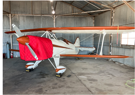
Travel Air 4000 Canopy and Engine Covers, light weight travel type SKYBOLT, Insulated Hangar Blanket, Custom Fit Interior Use)