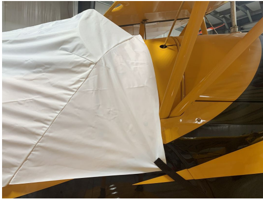
Bucher BU-133 Jungmeister Canopy Cover, test fit cover

the hottest of days. It is water, ice and snow repellent, yet breathable to allow moisture to escape from between the cover and the aircraft surface.