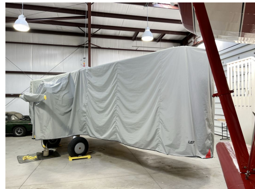
Stearman PT-13 Full Body Dust Cover, Prop Cover Included