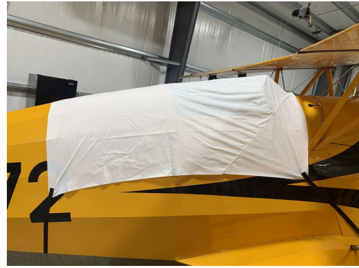
Bucher BU-133 Jungmeister Canopy Cover, test fit cover