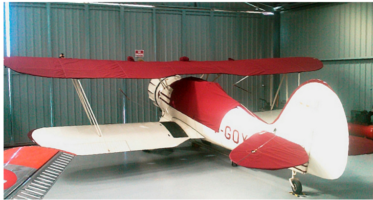
Waco UPF-7 Upper Wing Cover, Horizontal Stabilizer Cover & Canopy Cover

WINTER USE MATERIAL - Made with Solution-Dyed Polyester fabric, this option is intended for seasonal use to aid in deicing, rain mitigation, or for occasional travel. The material is lighter and more compact, but more susceptible to UV damage and may have a shorter useful life if used continuously outside than the all-year use material.