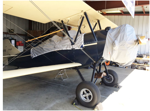
Travel Air 4000 Canopy and Engine Covers, light weight travel type