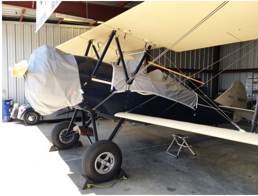
Travel Air 4000 Canopy and Engine Covers, light weight travel type

This cover type is made from Silver Acrylic Sunbrella canvas and is 100% lined with a soft and smooth microfiber. Bruce's Custom Covers developed this material combination especially for aircraft protection. The outer material is medium weight and treated for water resistance, UV resistance and anti-static buildup. The inner lining is a very soft and smooth microfiber to prevent scratching. The material is very reflective, and tests show that the cabin interior temperature can be reduced to near-ambient temperature on the hottest of days. It is water, ice and snow repellent, yet breathable to allow moisture to escape from between the cover and the aircraft surface.