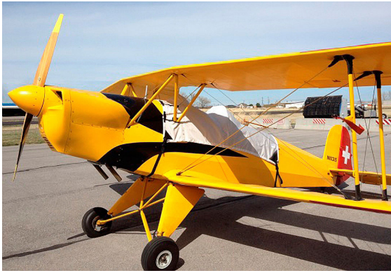
Bucker Jungmann Canopy Cover

the hottest of days. It is water, ice and snow repellent, yet breathable to allow moisture to escape from between the cover and the aircraft surface.