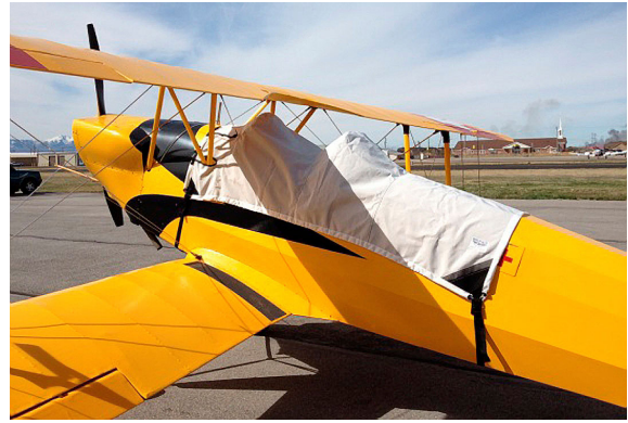
Bucker Jungmann Canopy Cover