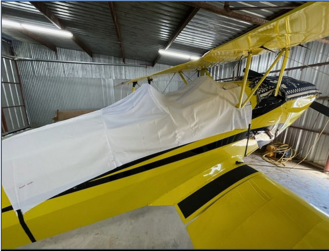
Bucker Jungmann BU-131 Canopy Cover, test fit cover