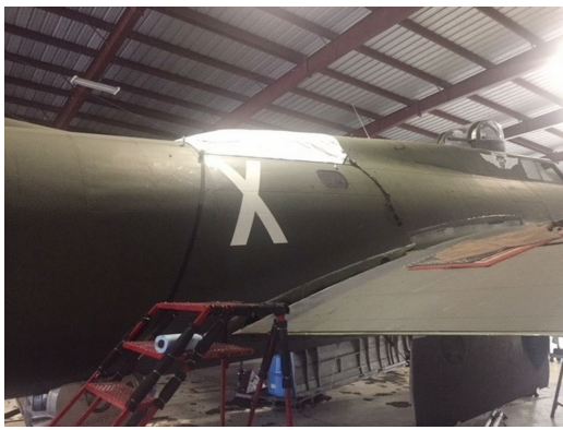
Hatch Cover on a classic B17.