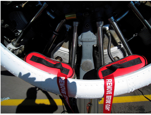
Beech 18 Carb Air Inlet Plugs