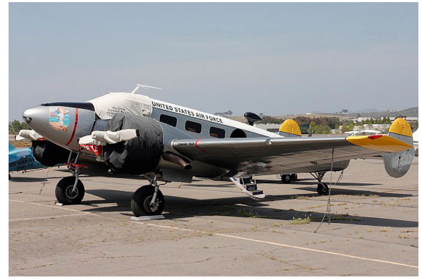
Twin Beech 18 Cockpit, Engine & Prop Covers