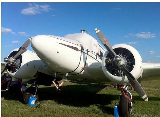
Beech 18 Cockpit Cover & Carb Inlet Plugs

This cover type is made from Silver Acrylic Sunbrella canvas and is 100% lined with a soft and smooth microfiber. Bruce's Custom Covers developed this material combination especially for aircraft protection. The outer material is medium weight and treated for water resistance, UV resistance and anti-static buildup. The inner lining is a very soft and smooth microfiber to prevent scratching. The material is very reflective, and tests show that the cabin interior temperature can be reduced to near-ambient temperature on the hottest of days. It is water, ice and snow repellent, yet breathable to allow moisture to escape from between the cover and the aircraft surface.