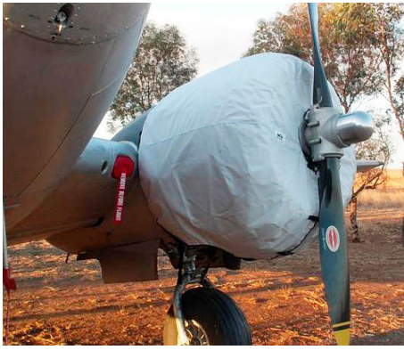
Beech D-18 Engine Covers, Center Section Oil Cooler Inlet Plugs, and Pitot Covers