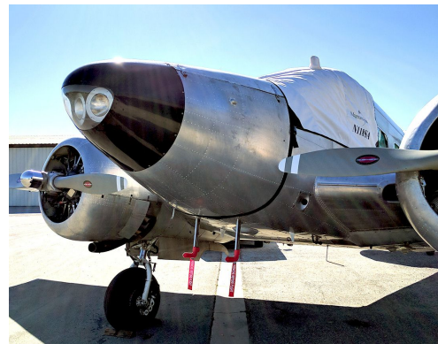
Beech Super 18 Cockpit Cover