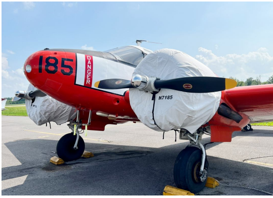
Beech 18 Engine Covers, non-insulated