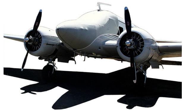
Beech 18 Cockpit/Nose Cover