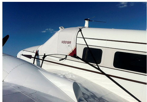
Beech 18 Cockpit Cover