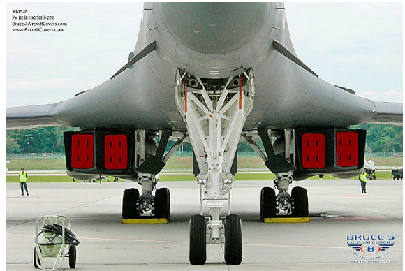
B1-B Bomber Intake Plugs