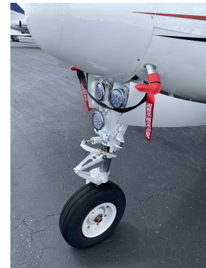
Beech King Air 350 Pitot Covers